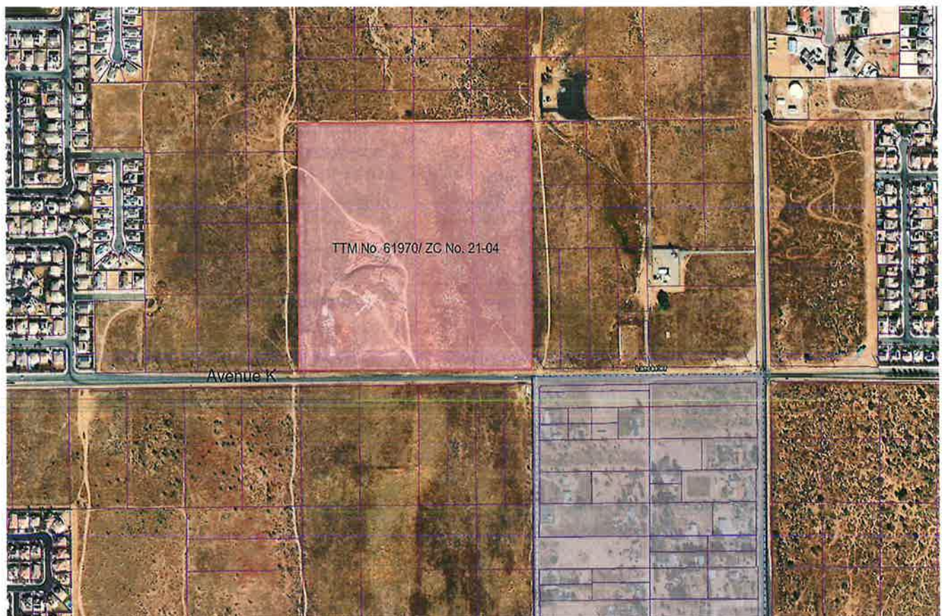
Figure 1, Project Location Map