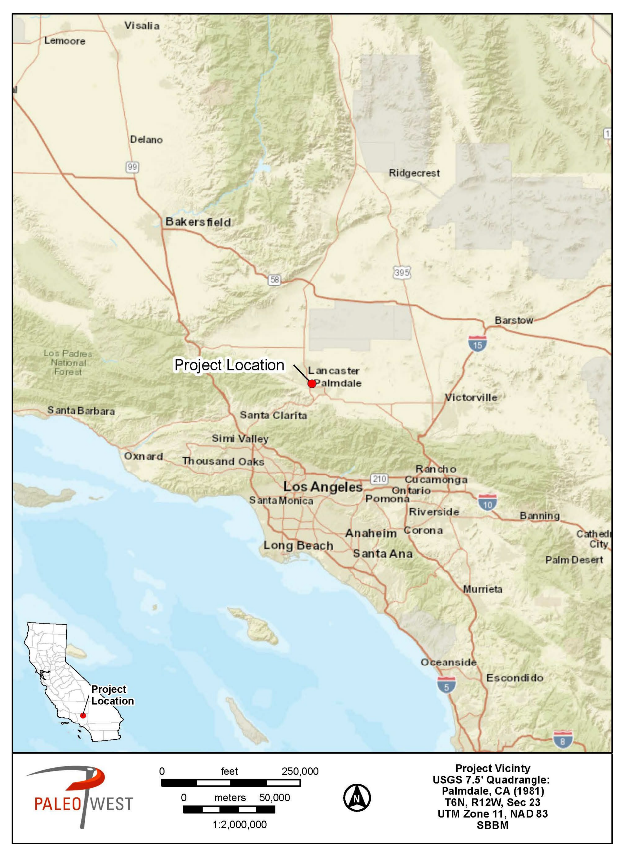
Figure 1: Project vicinity map.