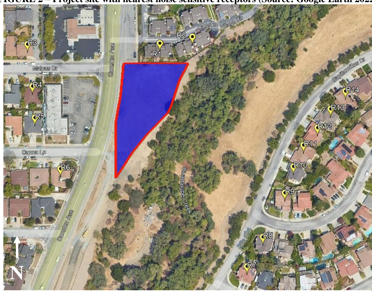
FIGURE 2 – Project site with nearest noise sensitive receptors

The construction noise levels were calculated to range from 75 to 86 dBA L_{eq} at 50 feet, using FHWA's Roadway Construction Noise Model (RCNM), which assumes that all the equipment could be operated simultaneously. At the closest residence (R1) located about 100 feet to the north (along Camden Village Circle), hourly average noise levels are calculated to range from about 66 to 80 dBA L_{eq} (as shown in Table 6).