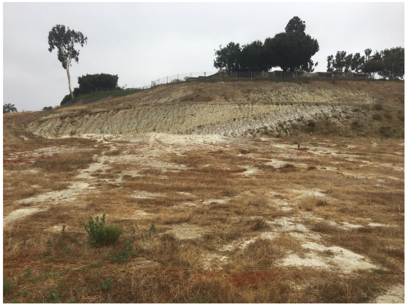
Figure 4. Eroded San Diego Formation outcrop at north end of the project site.