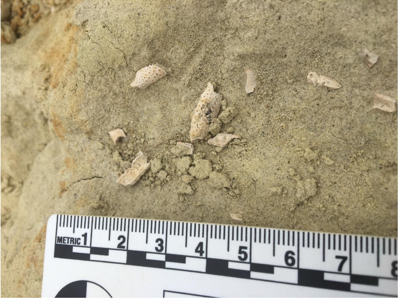
Figure 5. Fragmentary fossil crab weathering out of a San Diego Formation outcrop.