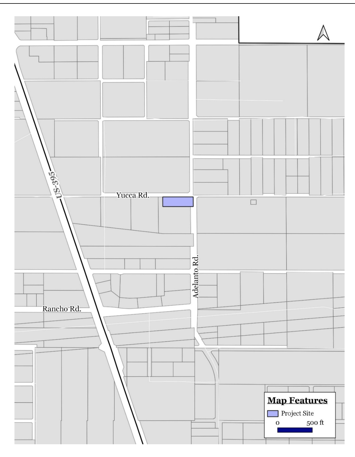
Figure 2: Project Site Location