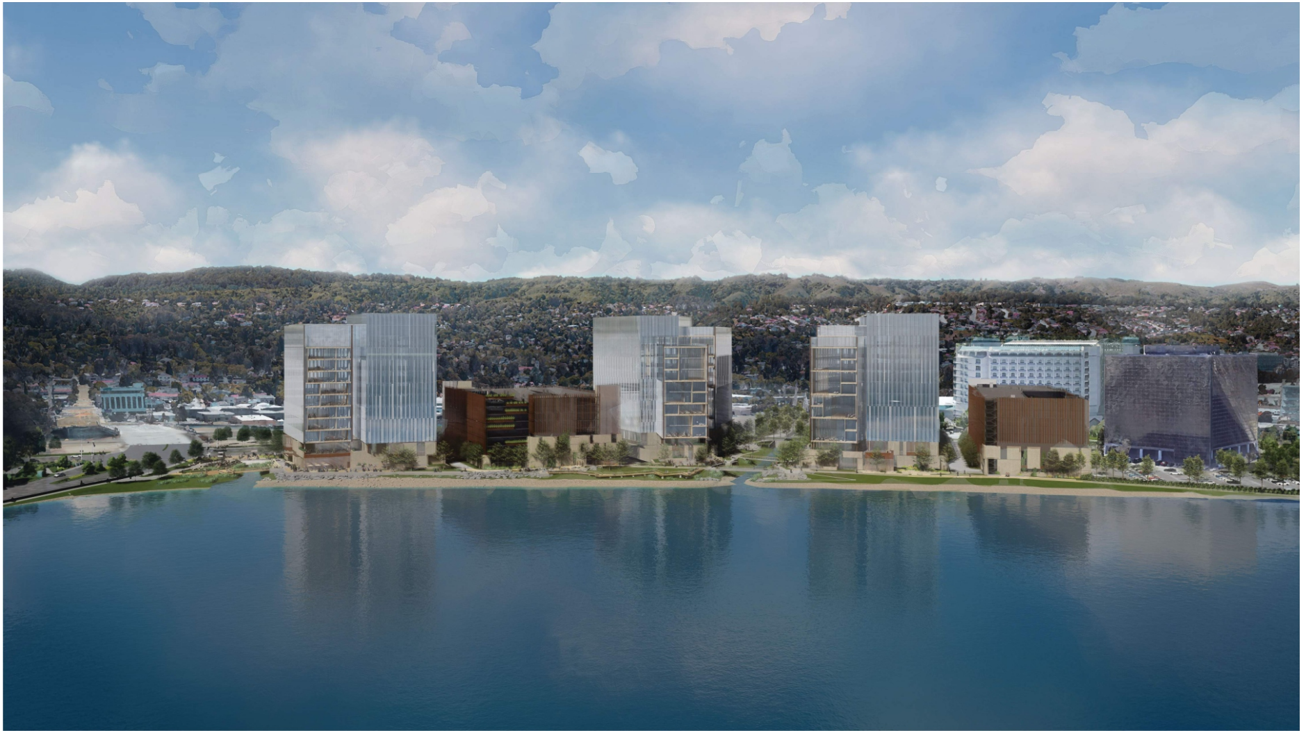
AERIAL VIEW LOOKING WEST TOWARDS BURLINGAME