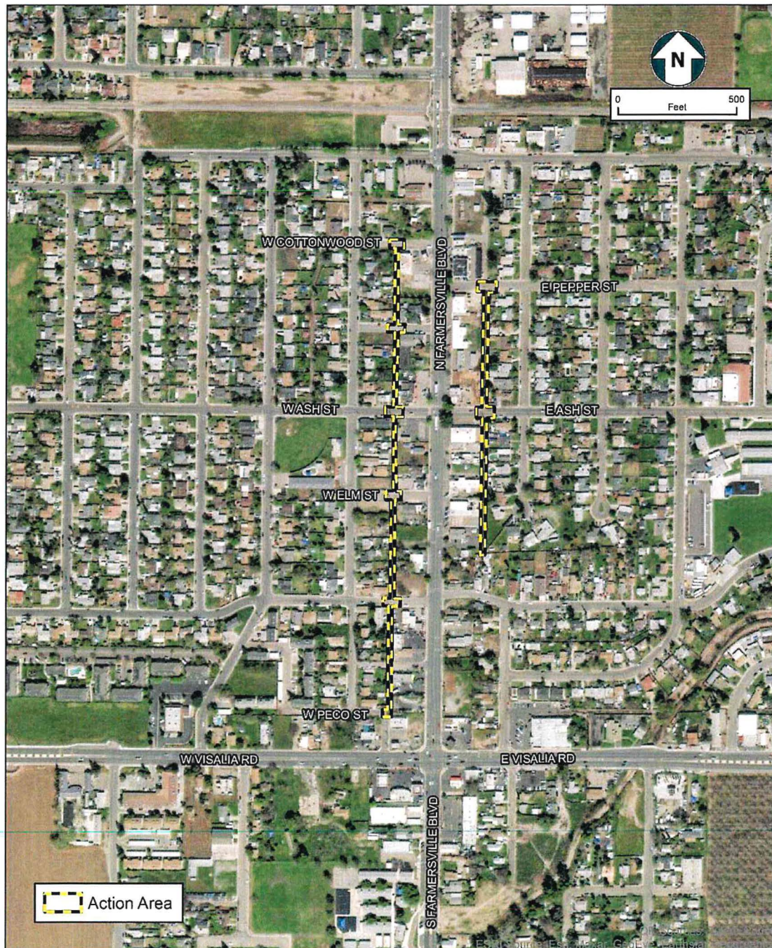
Farmersville Alleyway Reconstruction Project Location

The Project includes eight alley segments that run parallel to Farmersville Boulevard. On the west side of Farmersville Boulevard, six alley segments extend approximately 1/3-mile between West. Cottonwood and West Peco Streets. On the east side of Farmersville Boulevard, two alley segments extend approximately 1/4-mile from E. Pepper Street to north of E. Costner Street.