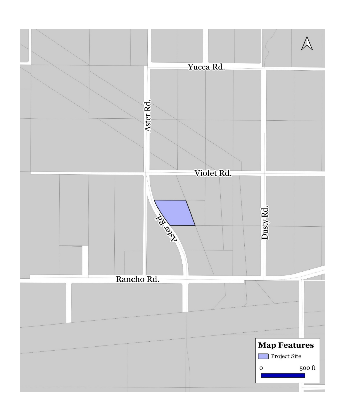
Figure 2: Project Site Location