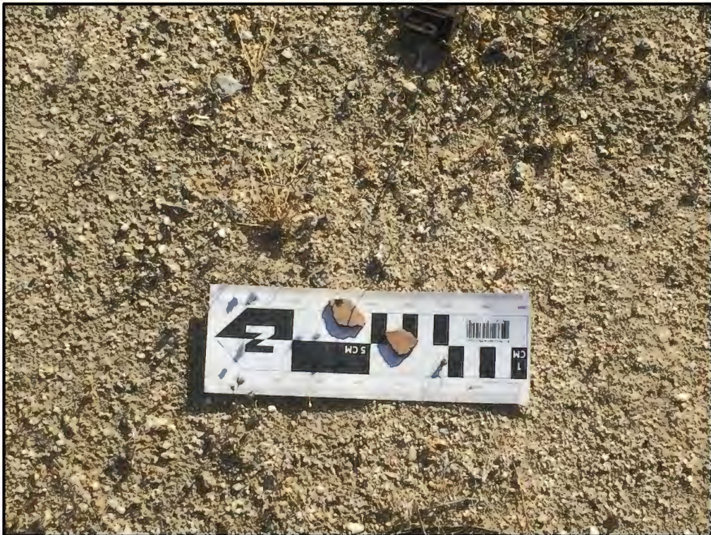
Plate 4: View of P-37-039312, two prehistoric SBW ceramic sherds.