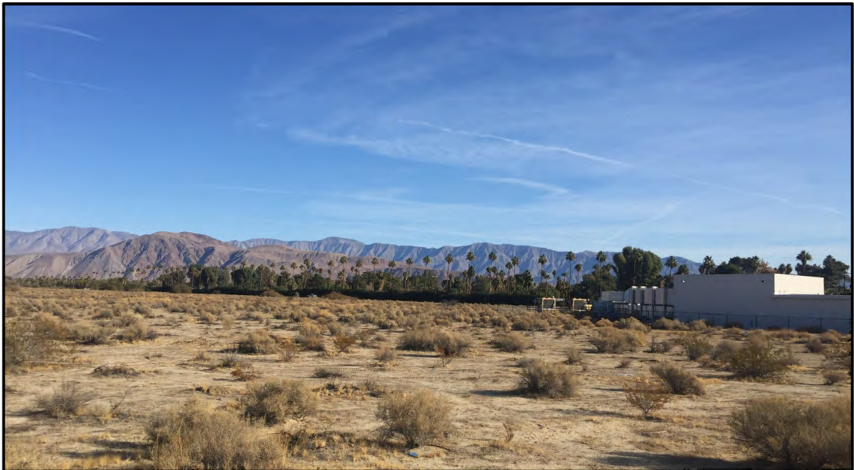
Plate 1: Overview of the project, facing northeast.

The survey included an intensive reconnaissance consisting of a series of parallel survey transects spaced at approximately five-meter intervals generally oriented from north to south across the property. The entire property was accessible and ground surface visibility within the proposed project was excellent. The only obstructions to ground visibility consisted of sparse pockets of native desert scrub vegetation, which was dominated by creosote bush. Noted disturbances to the subject property include dirt access roads along the western boundary and traversing the northern half of the project as well as road gravel, modern garbage, and building materials consisting of plastic, cement, asphalt, and glass, which have been dumped throughout the parcel. Photographs were taken to document project conditions at the time of the survey (Plates 1 and 2).