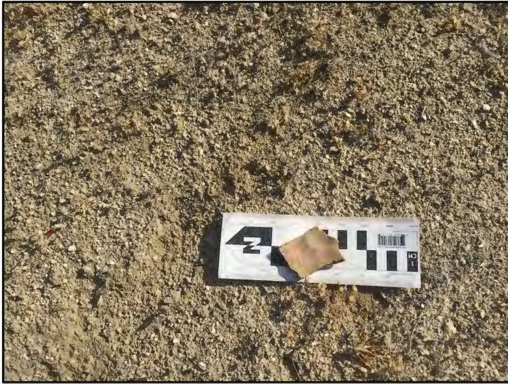
Plate 6: View of P-37-039313, a prehistoric SBW ceramic sherd.

The Phase I archaeological assessment for the Dollar General Store, Borrego Springs Project was negative for the presence of intact cultural resources. Three isolated artifacts were discovered on the surface. Based upon the previous clearing of the property and the proximity to the dirt road extending through the property, the isolates do not represent a primary deposit. While these isolates were identified and recorded, they do not retain any further research value. Based upon the results of the survey and the lack of significant, undisturbed cultural resources on this property, no site-specific mitigation measures will be required. However, because of the number of recorded sites in close proximity to the subject property, monitoring will be recommended as a condition of approval. Monitoring of grading would be conditioned to include both an archaeologist and a Native American representative during the grading. Standard County of San Diego monitoring protocols would be included as a condition of approval under the permit requirement for archaeological and Native American monitoring.