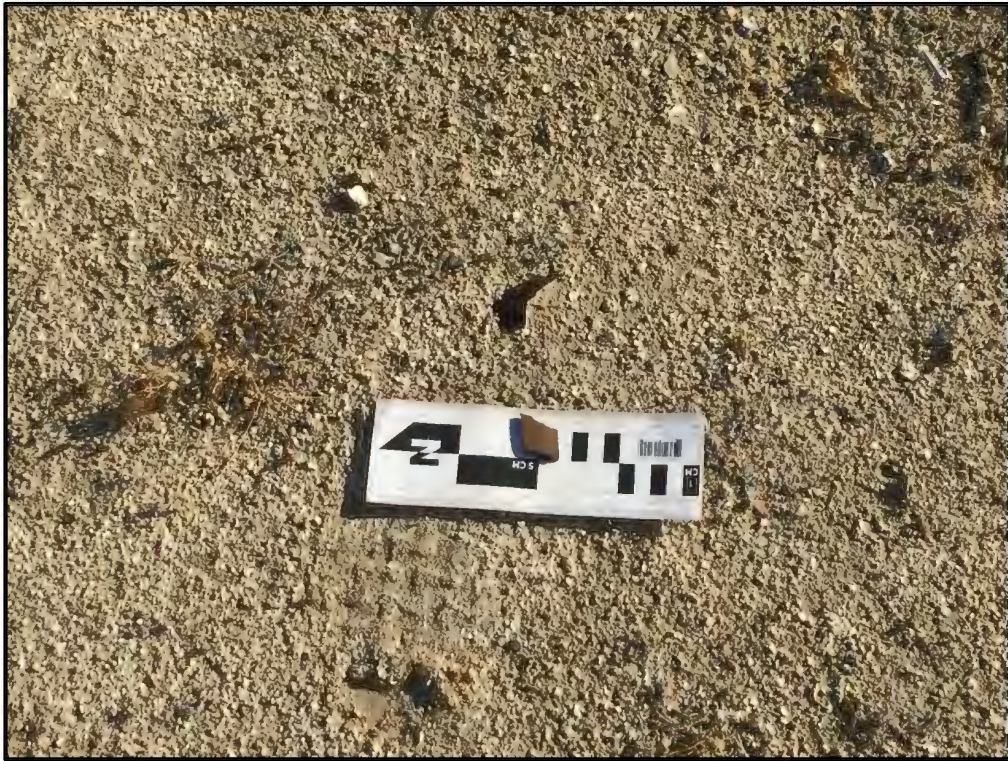
Plate 3: View of P-37-039311, a prehistoric SBW ceramic sherd.