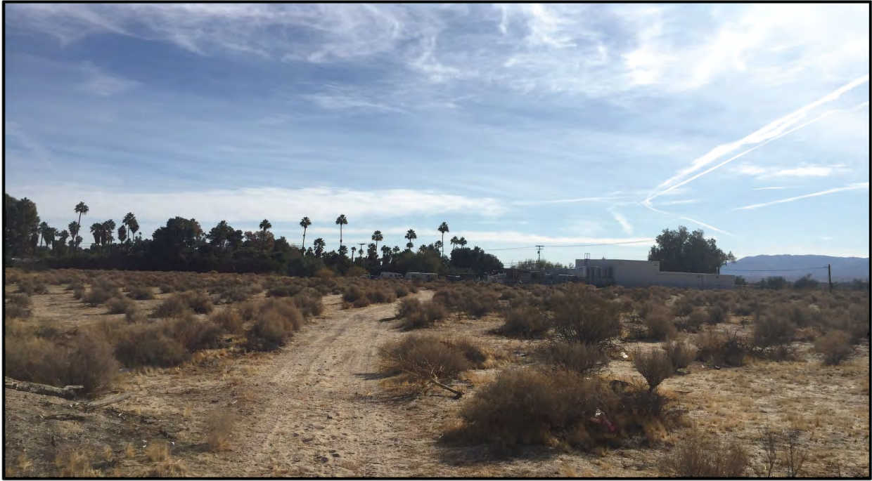
Plate 2: Overview of the project and dirt access road, facing east.

During the survey, three prehistoric isolates were identified and documented as P-37-039311, P-37-039312, and P-37-039313 (Figure 4 [Attachment E]). The isolates were recorded according to the Office of Historic Preservation's manual, Instructions for Recording Historical Resources , using Department of Parks and Recreation forms and submitted to the SCIC at SDSU (Attachment A). The isolates all are characterized as prehistoric Salton Brown Ware (SBW) sherds and were left in-situ, photographed, and their locations were recorded with sub-meter GPS equipment.