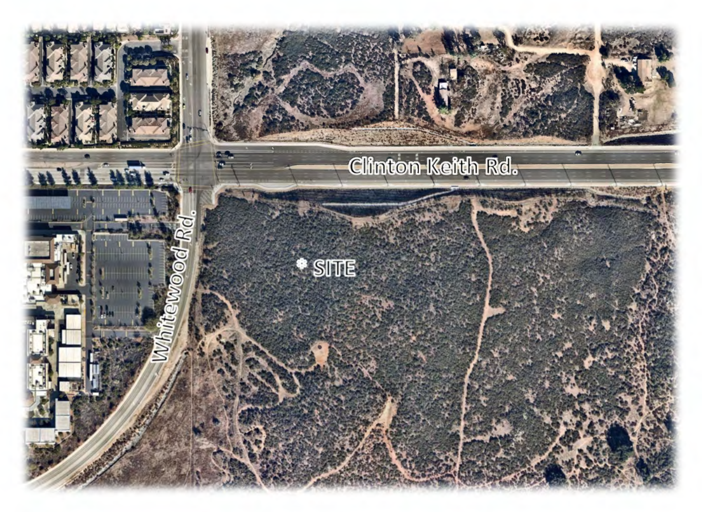
EXHIBIT A: LOCATION MAP

We are pleased to submit the following Parking Evaluation for the proposed Murrieta Residential development (referred to as "Project"). The Project is located on the southeast corner of Whitewood Road and Clinton Keith Road in the City of Murrieta as shown on Exhibit A. This Parking Evaluation was developed to ensure that the proposed site plan provides adequate on-site parking supply to accommodate peak on-site vehicle parking demands.