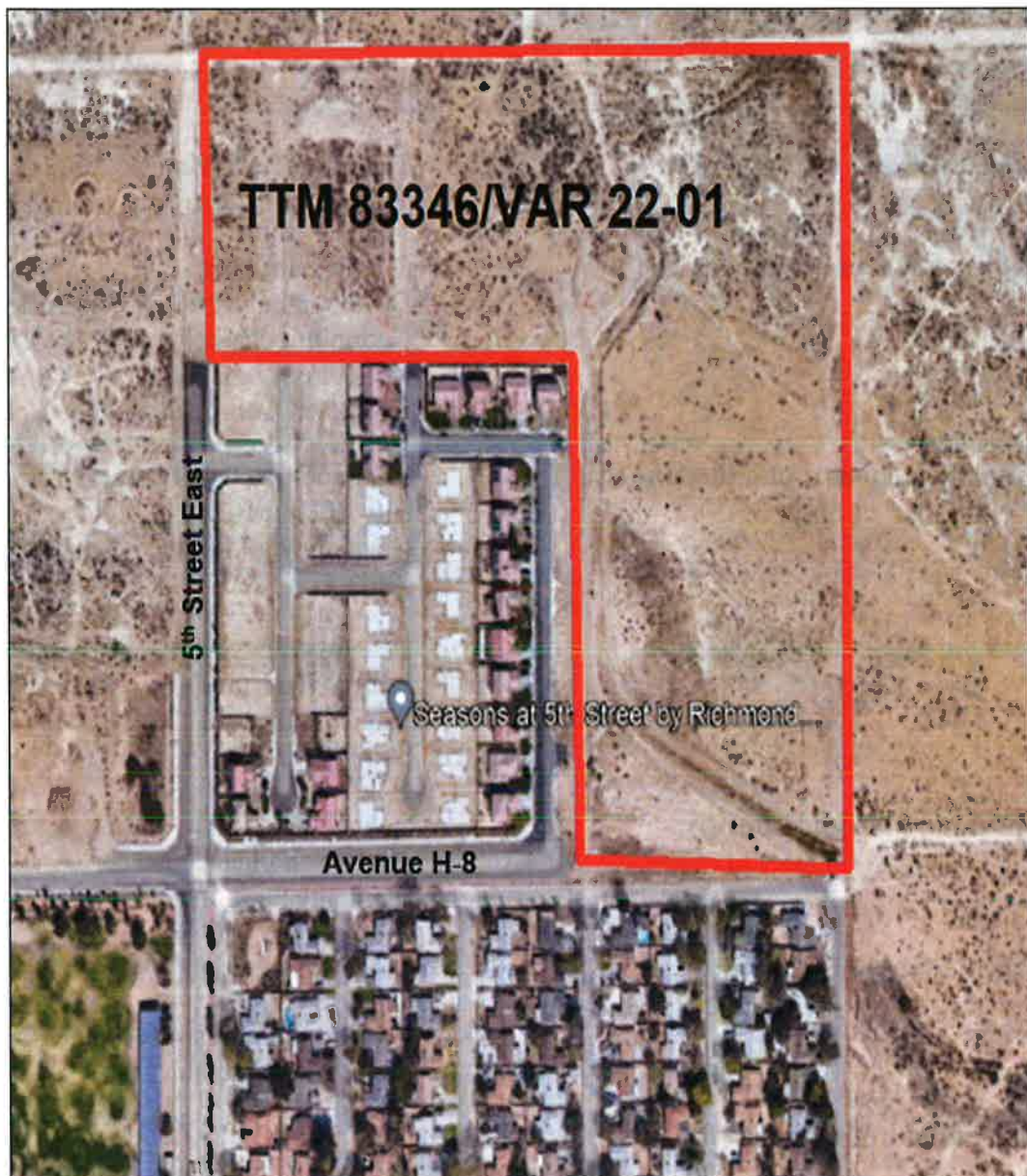
Figure 1, Project Location Map