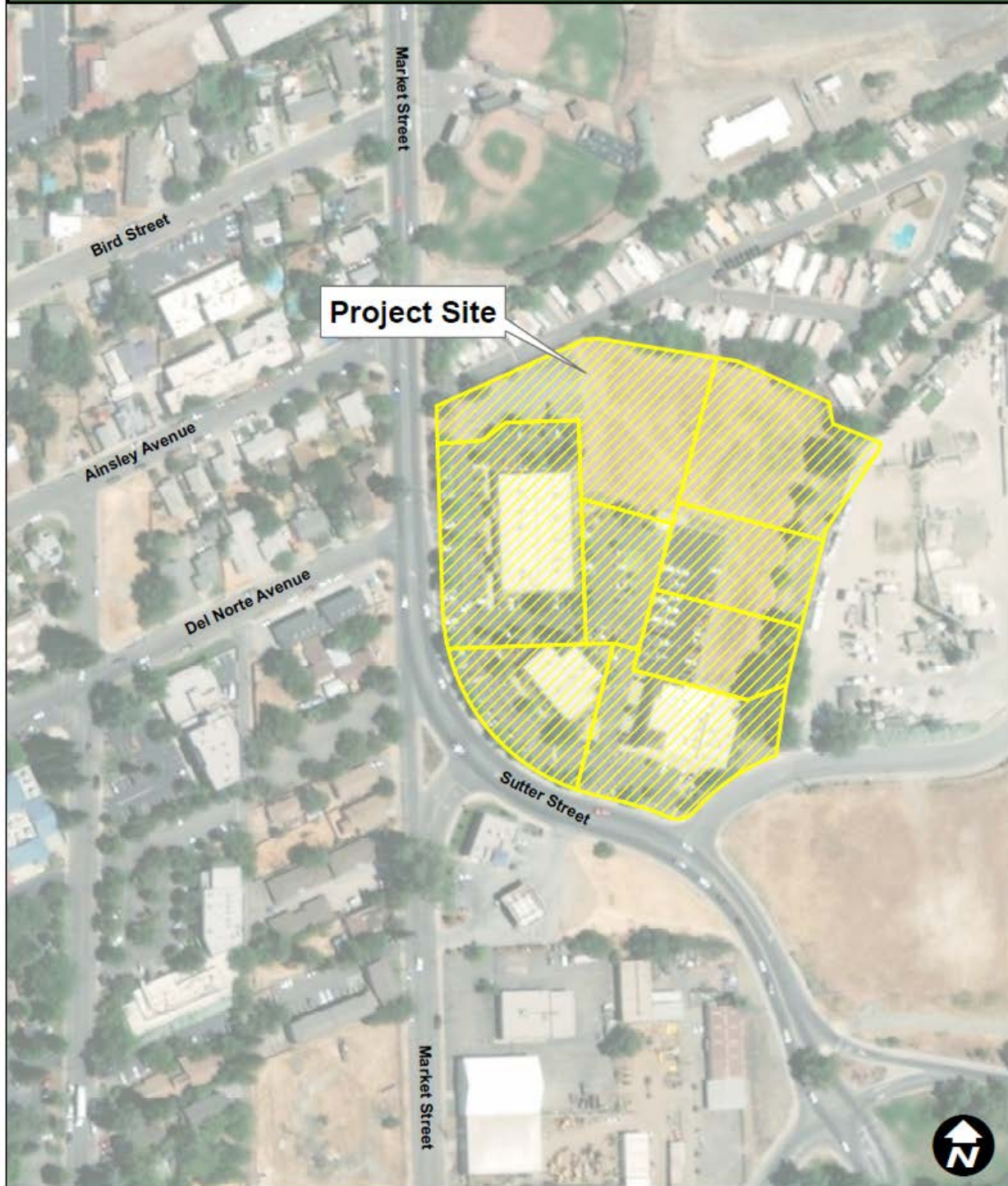
Figure 1 – Location Map