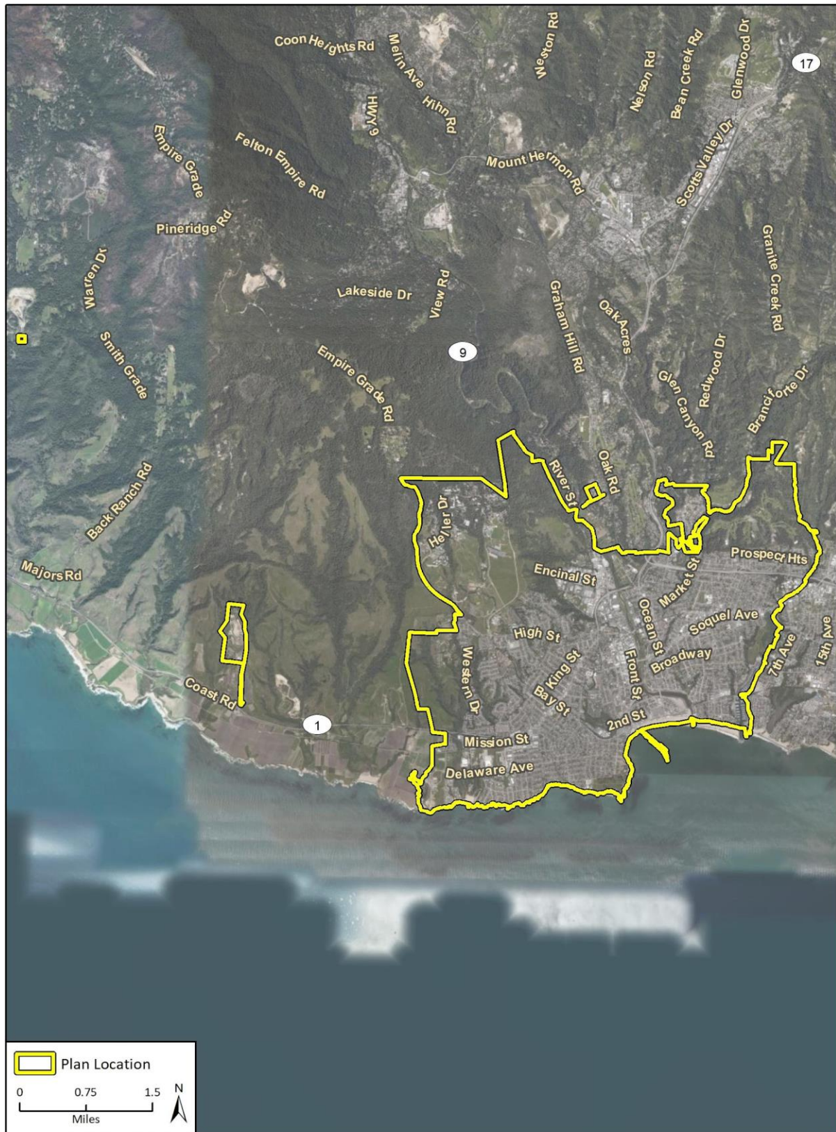
Figure 2 Plan Location