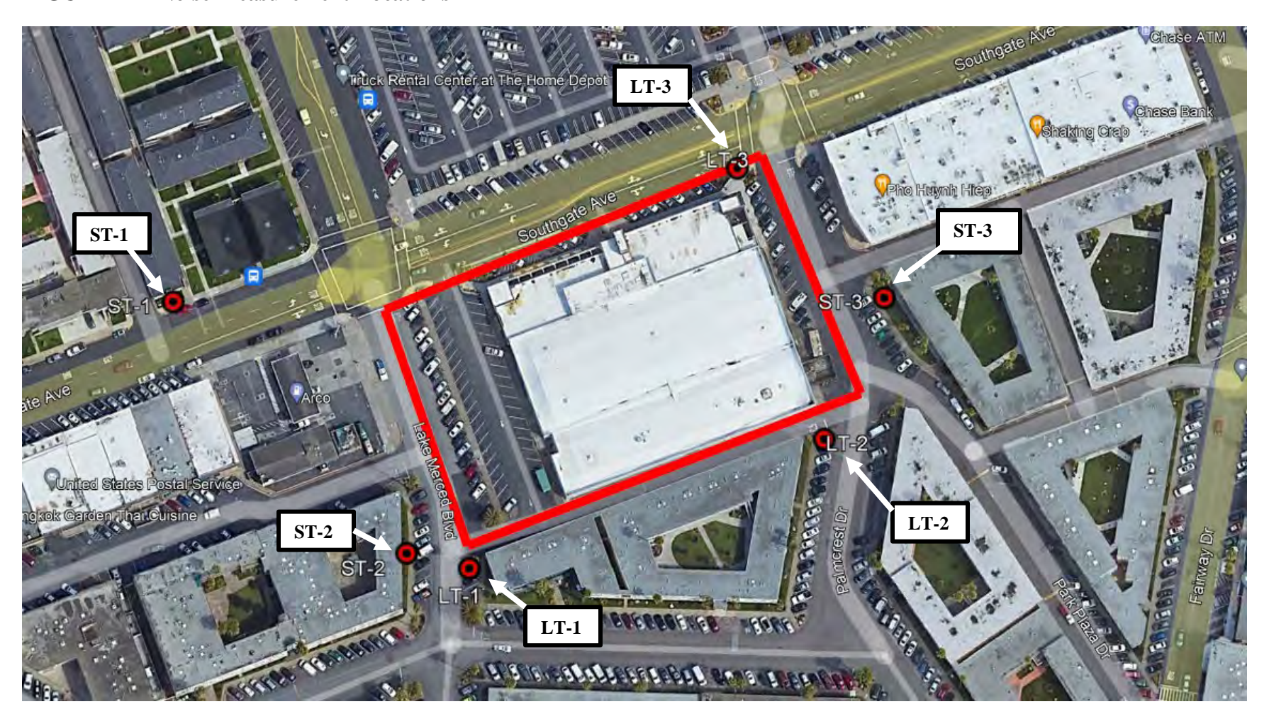
FIGURE 1 Noise Measurement Locations