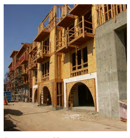
Construction could generate noise impacts that must be mitigated so adjacent uses are not singificantly impacted.