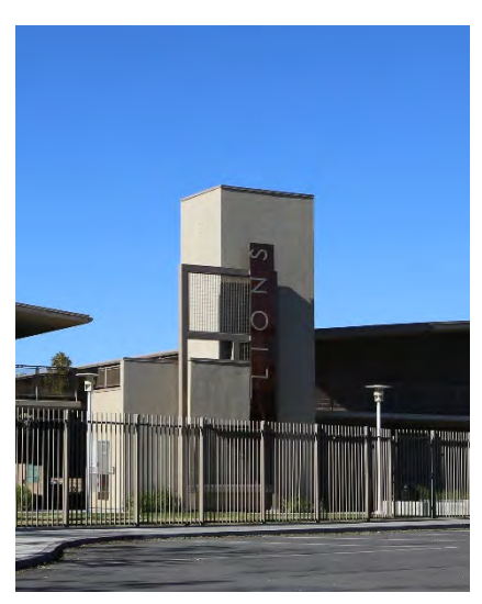
School are considered sensitive facilities and should be protected from noisegenerating uses.