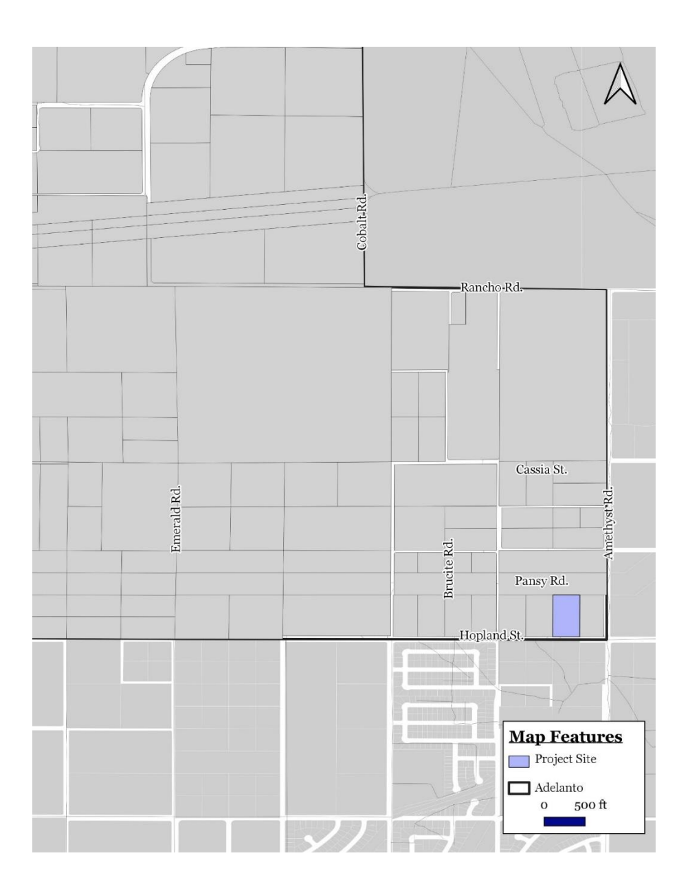
Figure 2: Project Site Location