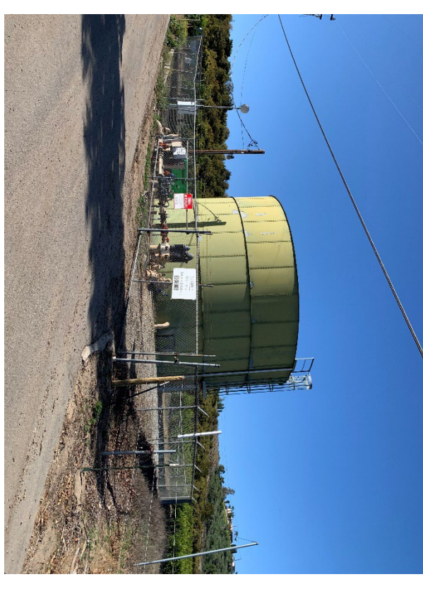
a. View of the existing reservoir from the access road, facing south