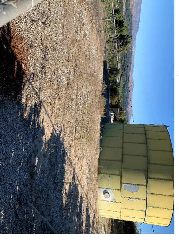
c. View of the proposed location of Tank 1, facing northeast