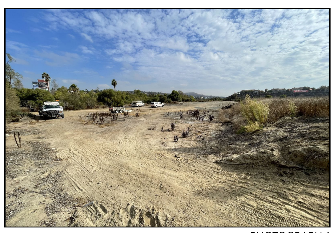
PHOTOGRAPH 1 Overview of Trail Improvement Alignment from Northwest Project Corner, Looking Northeast