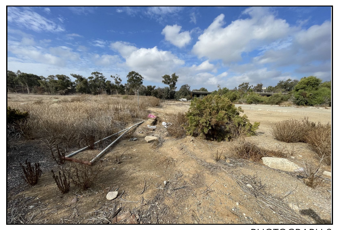
PHOTOGRAPH 2 Overview of Eastern Portion of Trail Improvement Alignment, Looking West