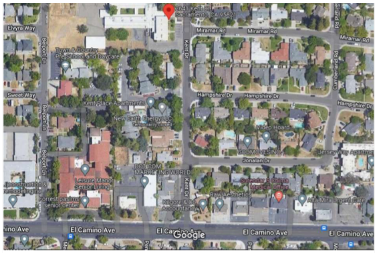
Imagery ©2022 Maxar Technologies, Sanborn, U.S. Geological Survey, USDA/FPAC/GEO, Map data ©2022 100 ft i...