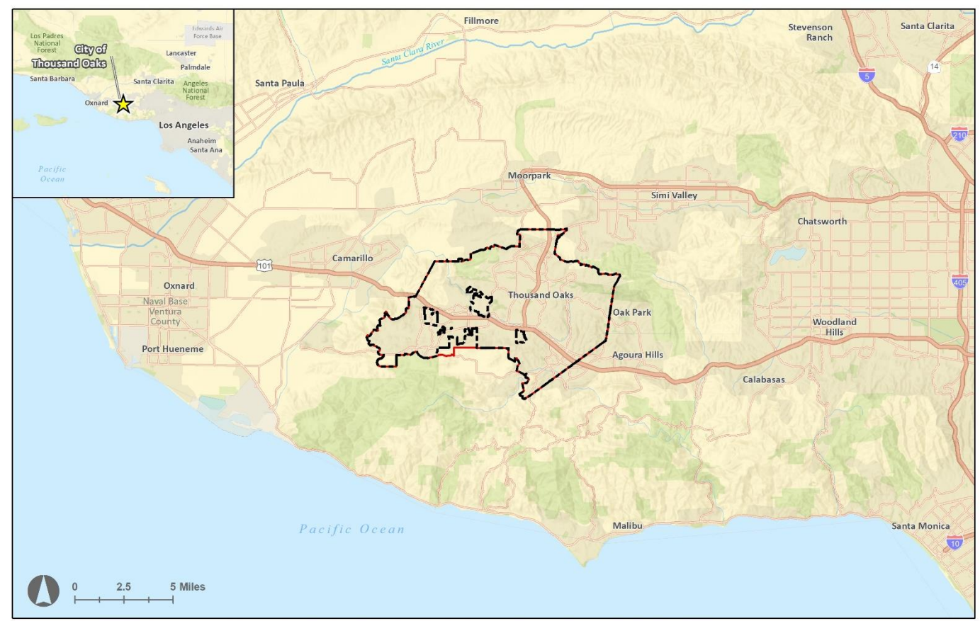
Raimi + Associates 2019 | Data Source: City of Thousand Oaks, County of Ventura, County of Los Angeles; State Water Resources Control Board, 2019