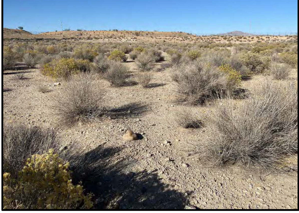
Figure 4. Representative photographs of the study area. Top photograph of site is from the southern boundary. Bottom photograph is within the northern portion of the site.