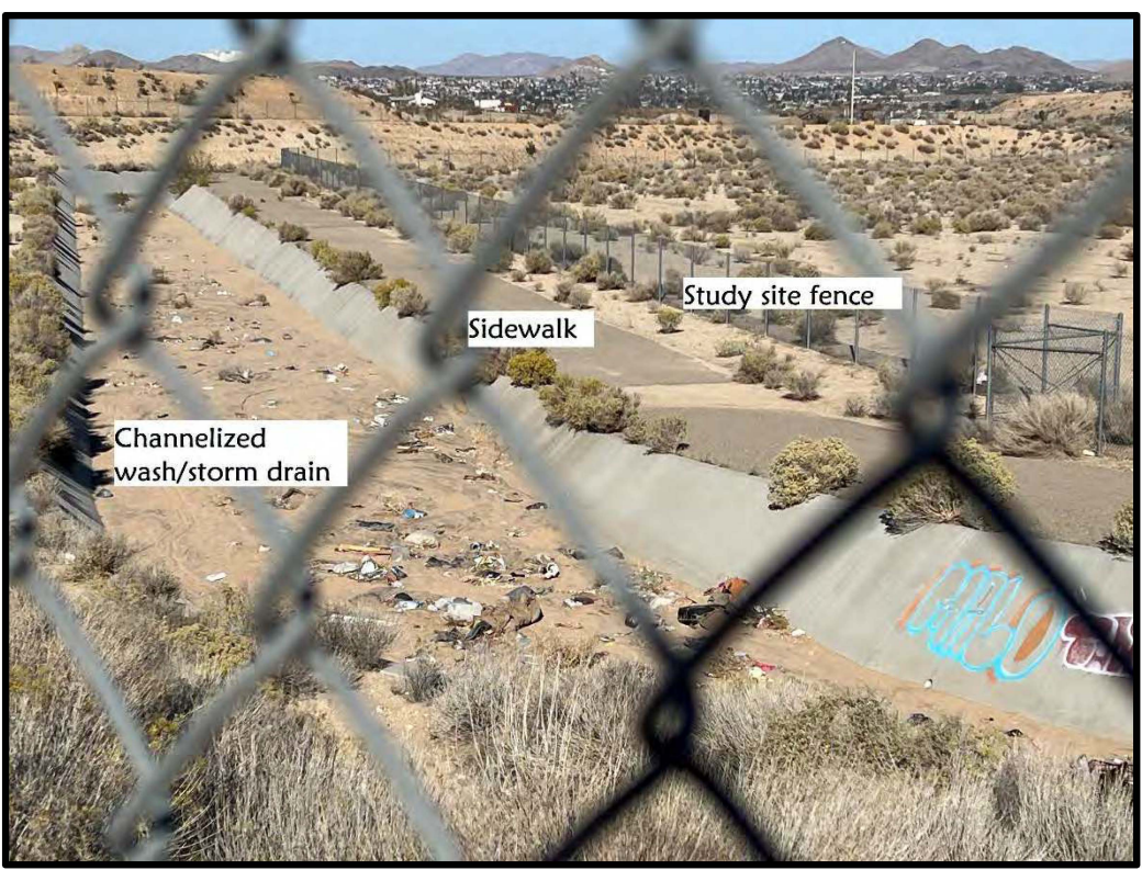
Figure 5. Representative photographs of the study area. Top photograph of site shows pipe used to drain water from adjacent property onto the study site. Bottom photograph shows the channelized wash/storm drainage present along the western and northern boundary of the site.