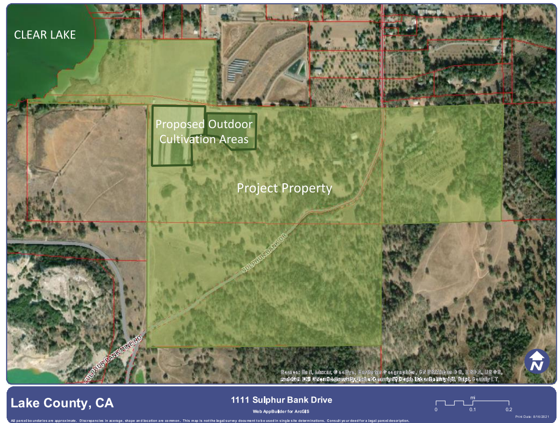
Figure 2: Aerial of the Site and Vicinity