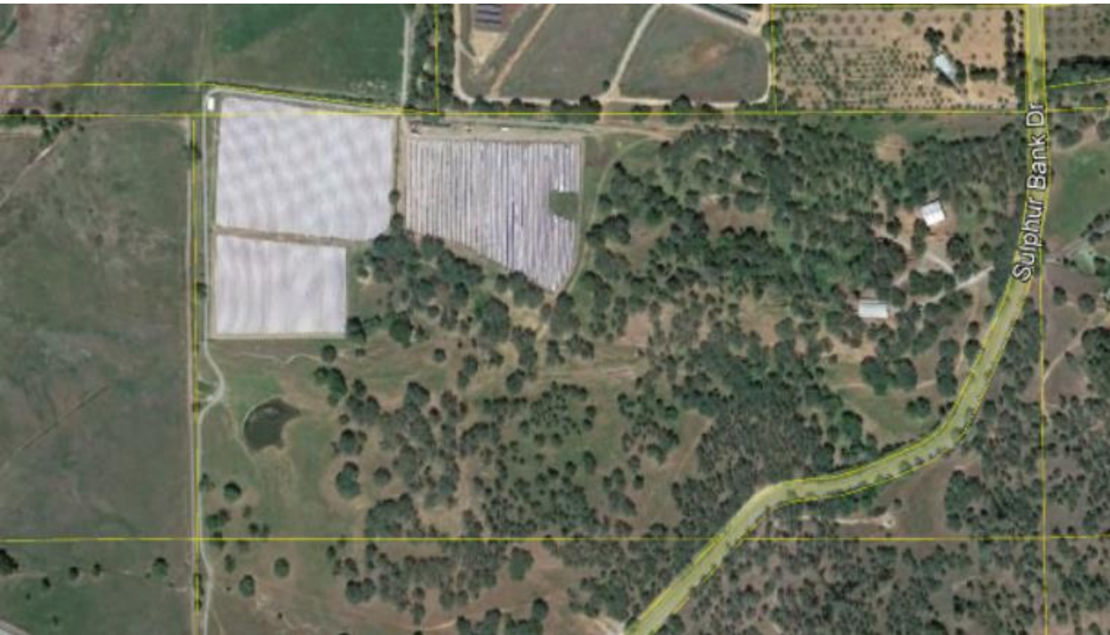
Figure 1. Google Earth Imagery of Proposed Cultivation. Please note: Property was granted Early Activation under Article 27, Section 27.4.

17. Description of Project: (Describe the whole action involved, including but not limited to later phases of the project, and any secondary, support, or off-site features necessary for its implementation. Attach additional sheets if necessary).