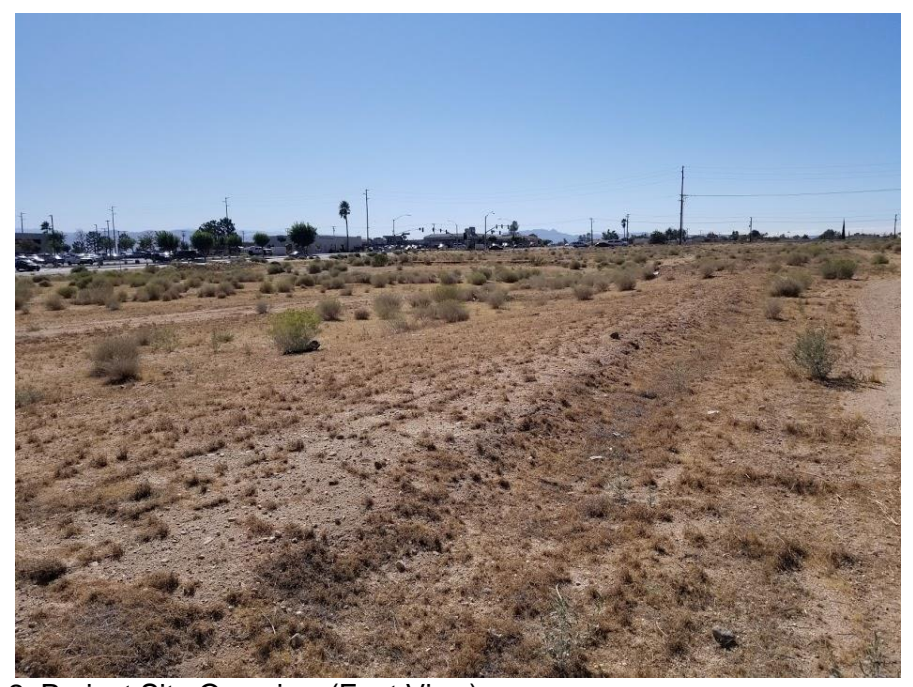
2. Project Site Overview (East View)