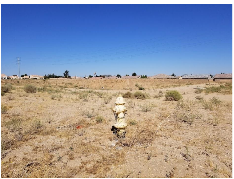
1. Project Site Overview (Northwest View)