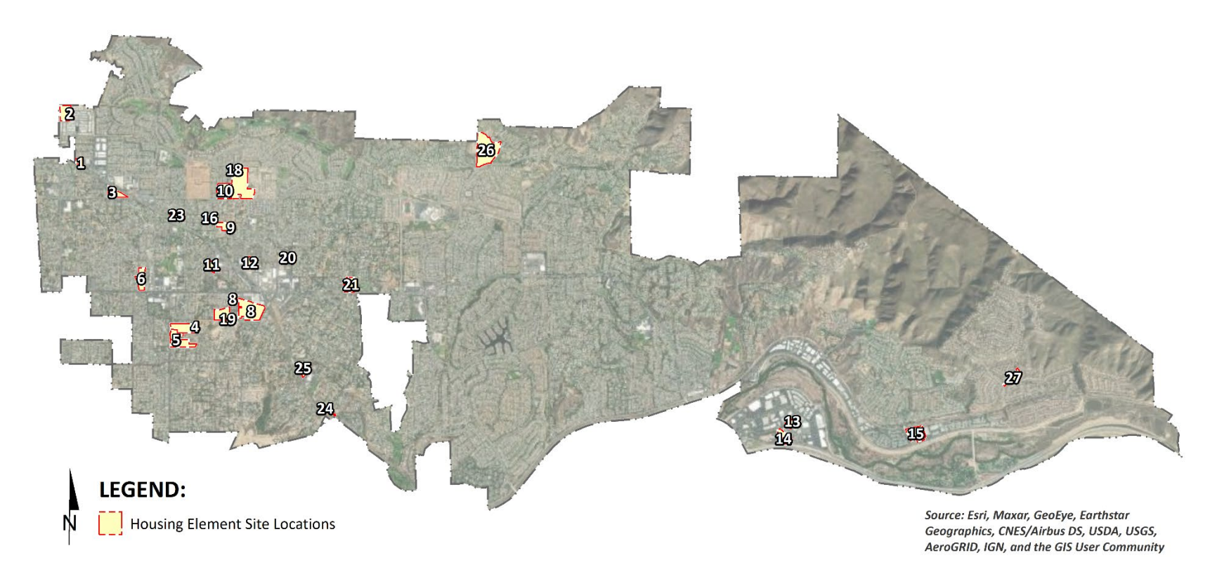
EXHIBIT 1-A: HOUSING ELEMENT SITE LOCATION MAP