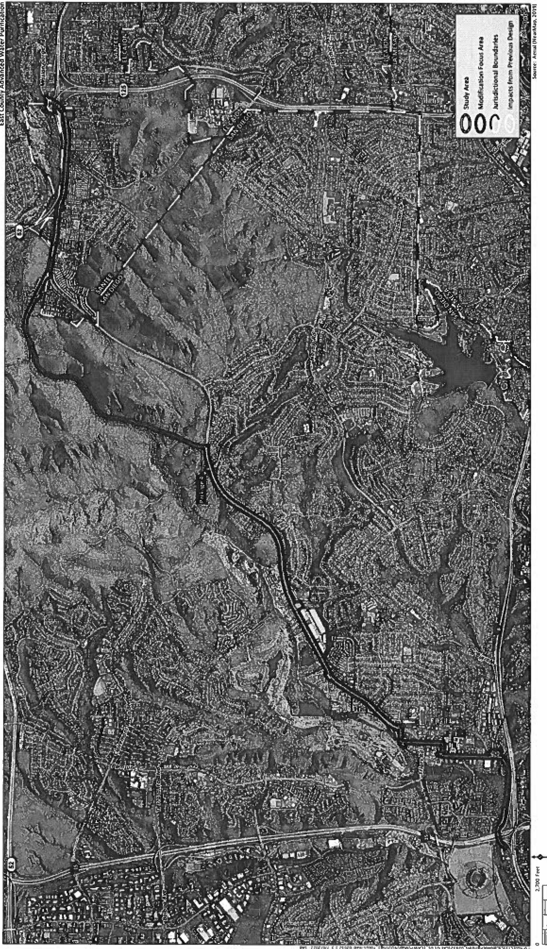
Project Modification Areas - Package 4 Figure 1b