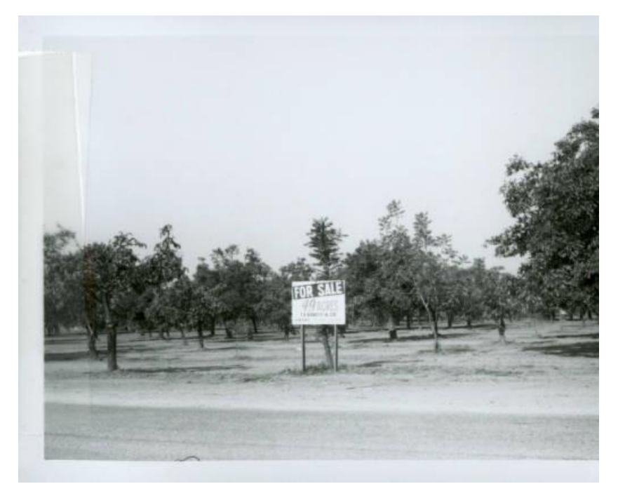
Figure 10. Photo from September 1967 of the northeast corner of Penitencia Creek Road and N. Capitol Avenue. 32. 6 acres of walnut orchard was up for sale by Burke Construction Co. (Caltrans., Right of Way Assessments 1967 ).