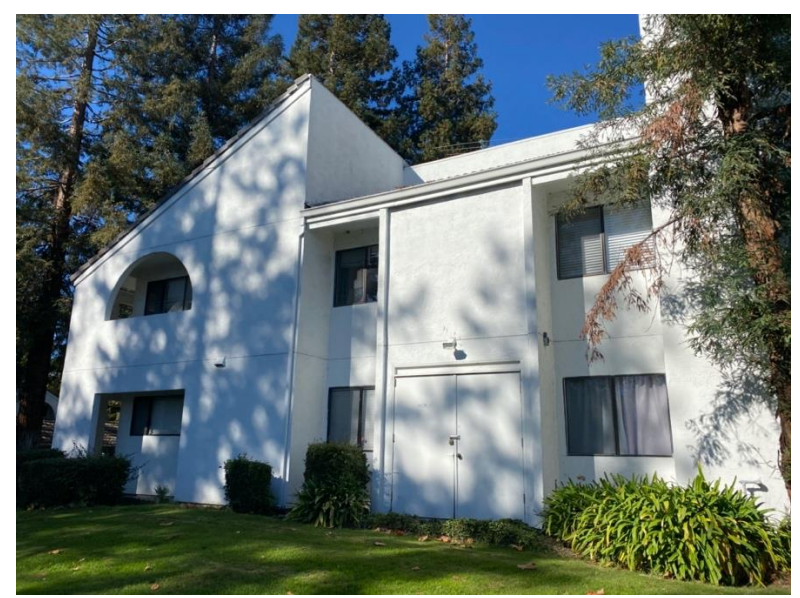
Figure 19. Building Two, north facade on Courtyard Berryessa.

Constructed in 1981, the Courtyard Berryessa garden units are two-stories and rectangular in plan. The units are Shed style, determined by their distinctive multi-directional shed roofs. The exterior is white stucco and exhibits minimal detail. Geometric cutouts of semi-circles, rectangles, and squares, and casement and sliding windows, punctuate the facade on both floors. The parking area features carports and parking spaces. The community totals eight buildings and 200 units.