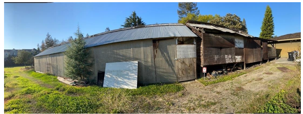
Figure 9. East façade of the shed.