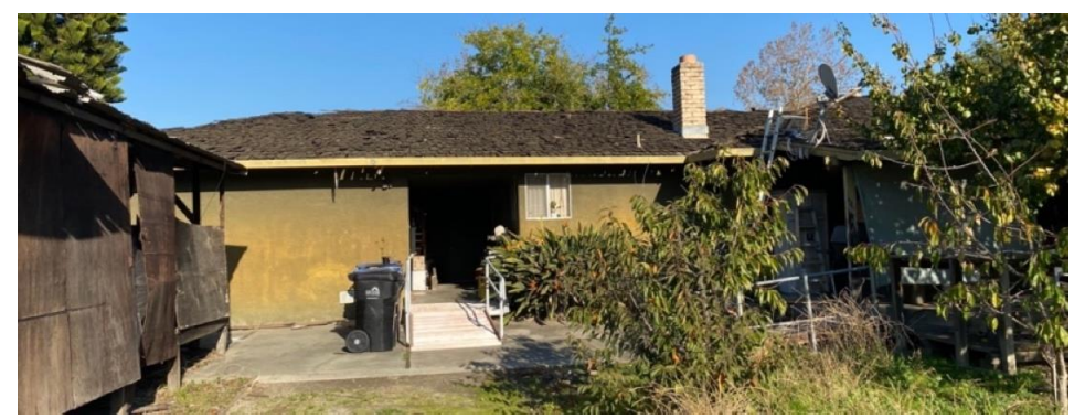
Figure 6. Recessed entry and porch, rear (southwest) elevation, of 905 N. Capitol Avenue.