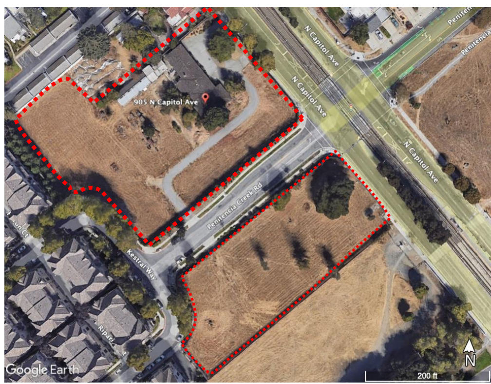
Figure 1. The subject parcels at 905 N Capitol Avenue, outlined in dashed red.

The parcel south of Penitencia Creek Road features a vacant grass lot, while the parcel to the north of Penitencia Creek Road features two structures: a single-story corrugated metal and plywood shed running perpendicular to N. Capitol Avenue, and a one-story over basement single-family house with an attached garage parallel to N. Capitol Avenue. The structures sit on the northern end of the parcel. The house is set back from the sidewalk approximately 80 feet. Typical of a rambling ranch-style home is a wider front lot, and the property features an asphalt parking lot for four vehicles. The driveway runs further along the east of the parcel, parallel and leading to Penitencia Creek Road.