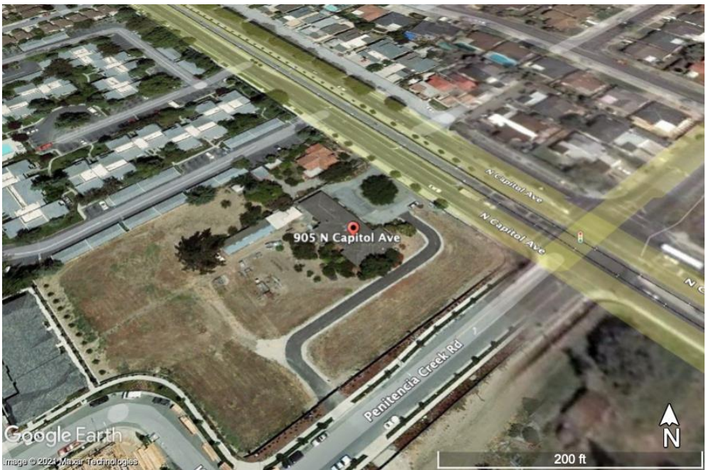
Figure 16. 905 N. Capitol Avenue (Google Earth, Image Date July 2007).