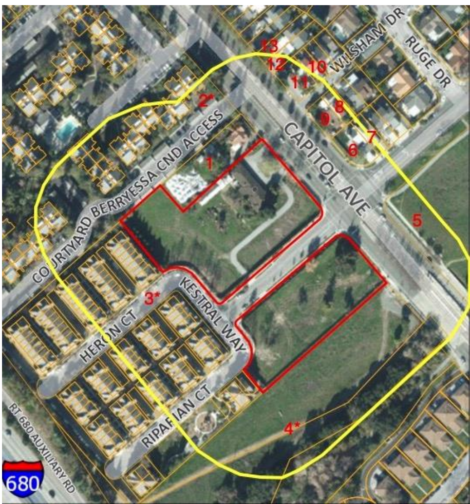
Figure 17. Surveyed properties situated within 200 feet of the project site boundaries. The project site is outlined in red.