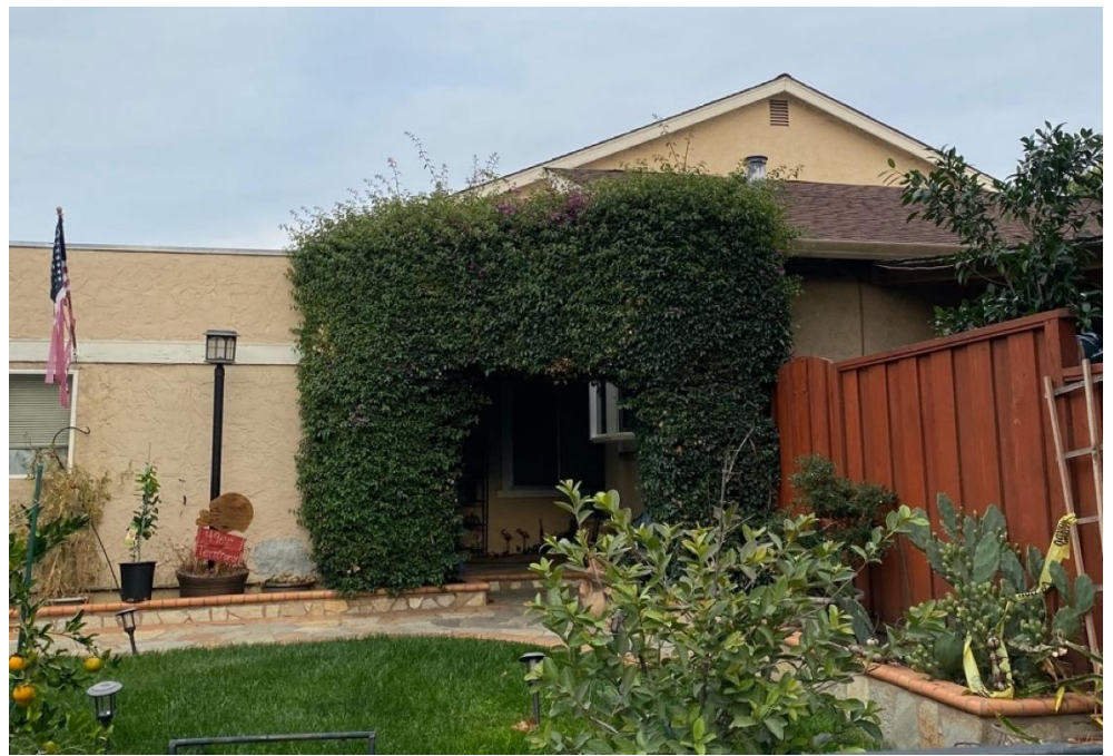
Figure 27. 1016 N. Capitol Avenue. Southwest façade.