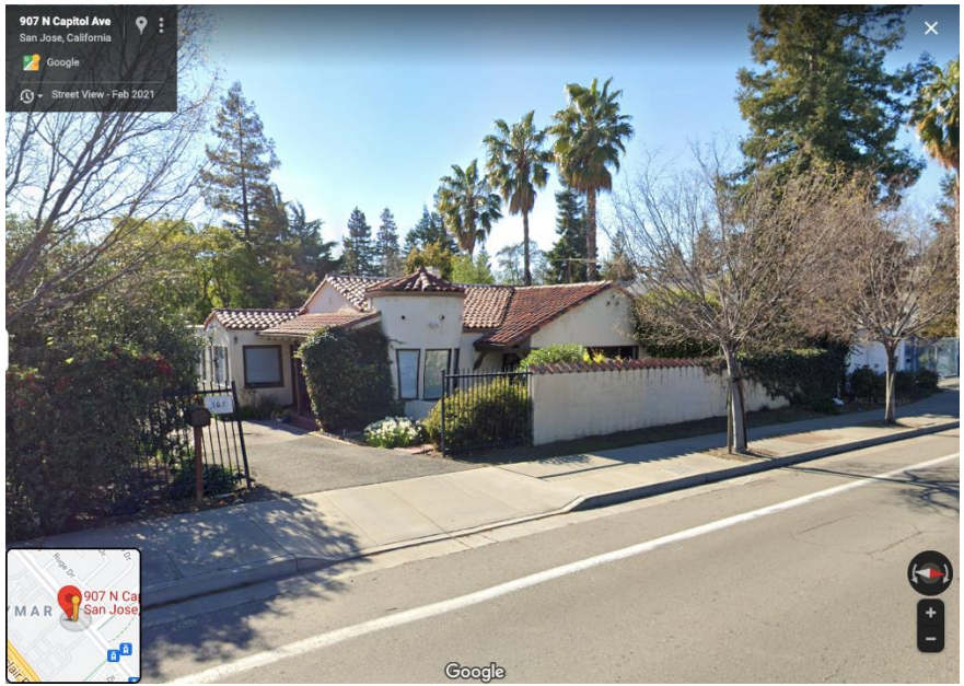
Figure 18. 907 N. Capitol Avenue. Google Maps, Image Date February 2021.