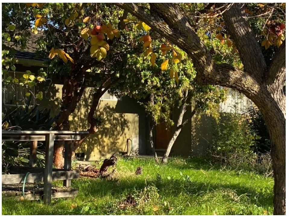
Figure 7. Southeast corner of 905 N. Capitol Avenue.