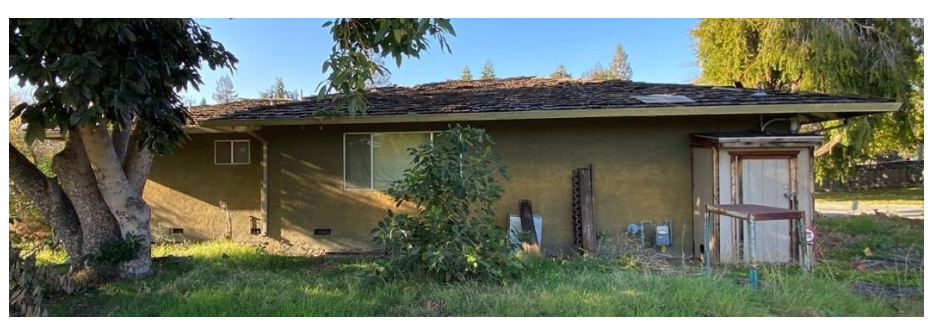
Figure 4. Side (southeast) façade of 905 N. Capitol Avenue.