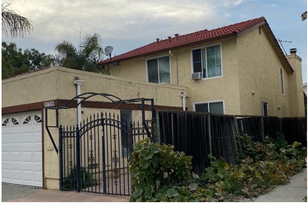
Figure 29. 1028 N. Capitol Avenue.

aluminum-sash sliding window. Notable features include an iron-wrought fence on the east façade. The detached garage sits on the southeast section of the parcel and features a flat roof.