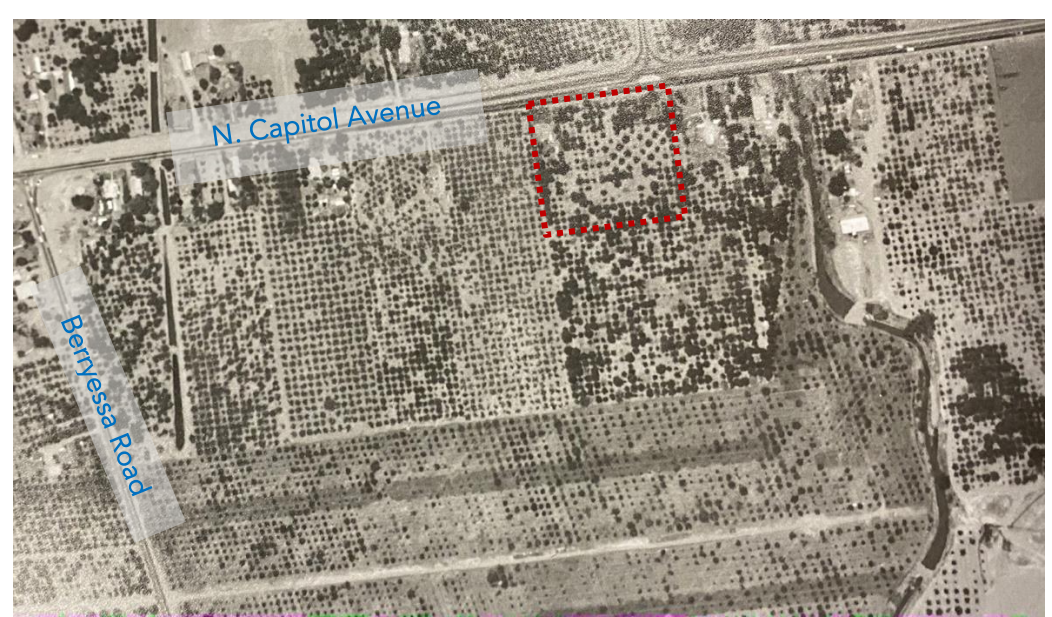
Figure 12. United States Geological Survey 1968 aerial map, San Jose. The approximate location of the subject parcel is outlined in dashed red (San Jose Public Library, California Room).

Between 1968 and 1969, the orchard farms were cleared on and around the subject property. The late 1960s and into the 1970s was a period of extensive residential development in this area. The blocks from Sierra Road to Mabury Road along N. Capitol Avenue transformed from mostly agricultural land to residential buildings. The block between Penitencia Creek Road and Mabury Road on N. Capitol Avenue was zoned for multi-family homes, and construction was completed for the Gilchrist condominiums in 1969.<sup>9</sup> The single-family residences north of N. Capitol Avenue and Penitencia Creek Road were constructed in 1977.<sup>10</sup> The wave of development continued on into the 1980s, when the Courtyard Berryessa Condominiums were completed c. 1981.<sup>11</sup>