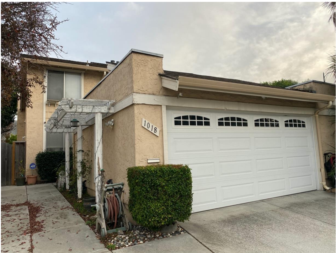
Figure 26. 1018 N. Capitol Avenue.

sash sliding window. Notable features include a rake overhang and a shallow one-story trellis attached to the east side of the garage. The detached garage features a combination shed-flat roof and sits on north of the house, obscuring the main entrance.