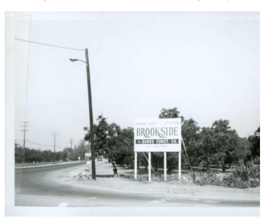
Figure 11. South corner of Penitencia Creek Road and N. Capitol Avenue. The two-way street is visible on N. Capitol Avenue (Caltrans., Right of Way 1967 , 4723).

Figure 10. Photo from September 1967 of the northeast corner of Penitencia Creek Road and N. Capitol Avenue. 32. 6 acres of walnut orchard was up for sale by Burke Construction Co. (Caltrans., Right of Way Assessments 1967 ).