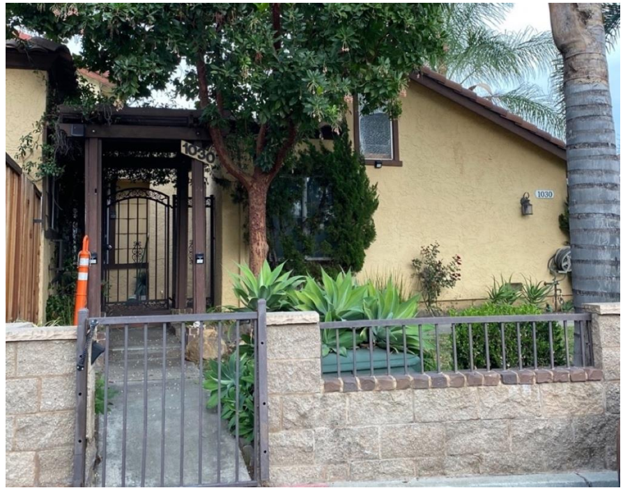
Figure 30. 1030 N. Capitol Avenue.