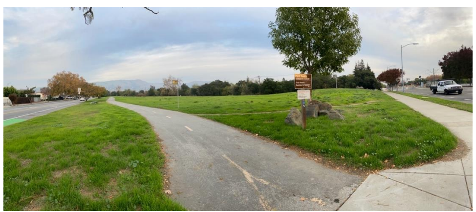
Figure 23. East Corner of N. Capitol Avenue and Penitencia Creek Road.

This parcel features a grassy area of the park with a paved portion of Penitencia Creek Trail running parallel to Penitencia Creek Road. There are no built structures.