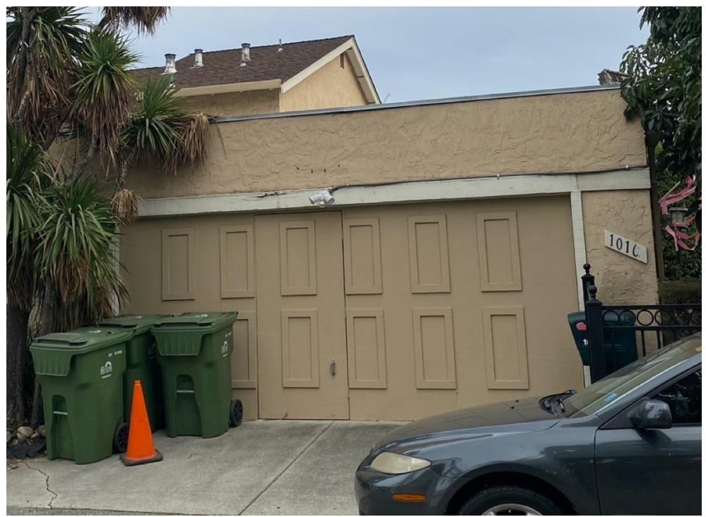
Figure 28. 1016 N. Capitol Avenue. Northwest façade.