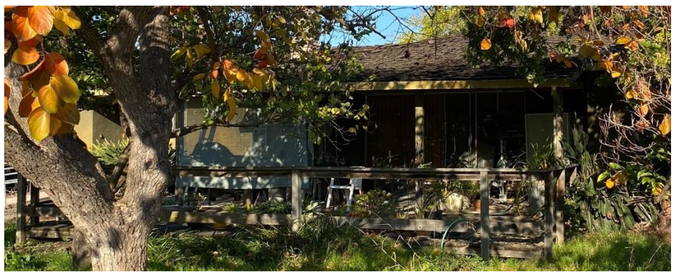
Figure 5. Porch on the rear (southwest) façade of 905 N. Capitol Avenue.