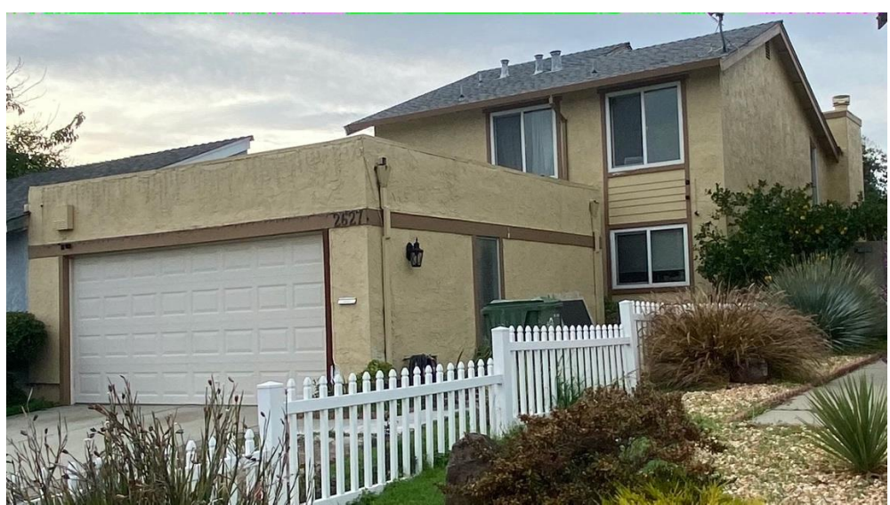
Figure 25. 2627 Penitencia Creek Road.

Constructed in 1977, this vernacular two-story single-family is roughly rectangular in plan.<sup>36</sup> The exterior has stucco cladding and minimal detail, except for the clapboard details between the first and second story sliding windows. The house features a moderately-pitched side gabled roof, while the detached two-car garage features a flat roof. Aside from a simple square chimney, the north side of the property is not visible. The property is set back approximately 22 feet from the sidewalk along Penitencia Creek Road. The condition of the house is fair.