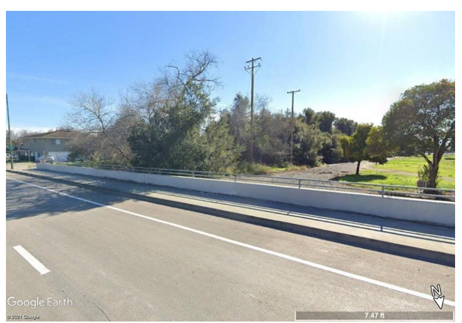
Figure 22. 851 N. Capitol Avenue (Google Earth, Image Date 2021).

This parcel features a wooded area with no built structures.