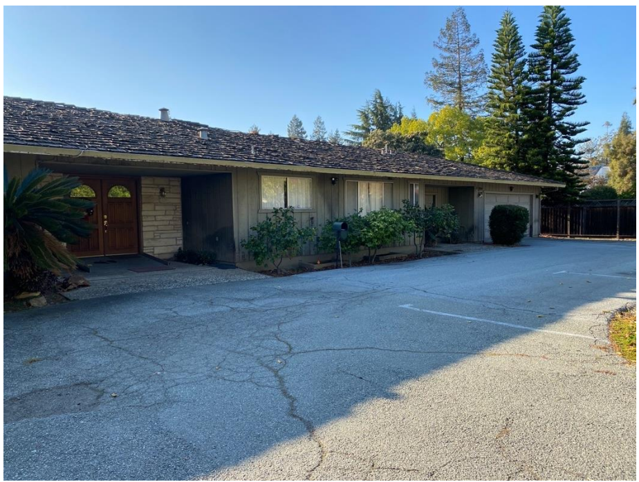
Figure 3. Northwest façade of 905 N. Capitol Avenue. Detail of recessed entries and attached garage.