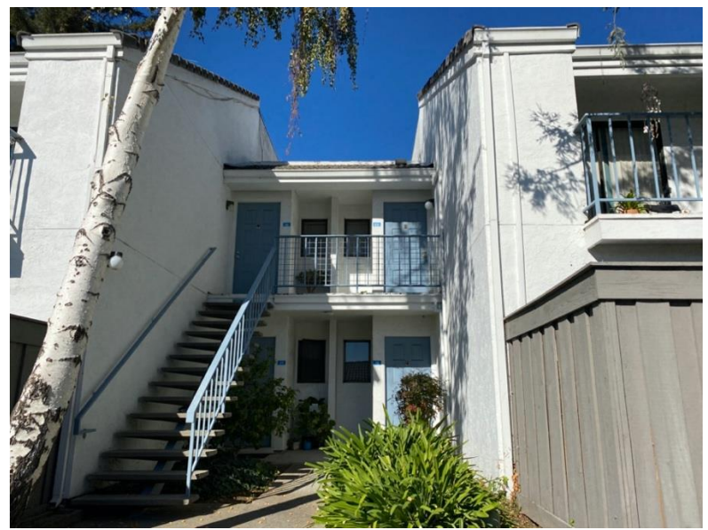
Figure 20. Main entries for units 17-20, facing southeast.