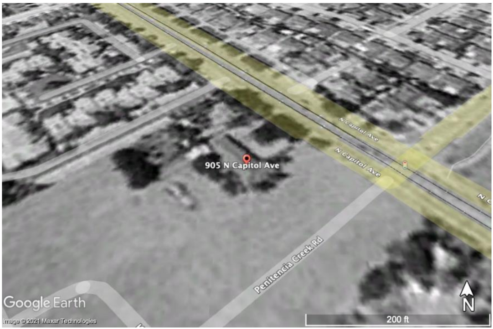
Figure 15. N. Capitol Avenue (Google Earth, Image Date June 1993).

Between 2006 and 2007, an asphalt driveway was constructed, from the northeast to the southeast section of the parcel; leading from the property to Penitencia Creek Road.<sup>15</sup> A 2006 permit was found for the installation of an electric gate along Penitencia Creek Road for the entrance/exit of the driveway.<sup>16</sup> The shed behind the property that runs parallel to Penitencia Creek Road was built in the 1980s, although no permits were found.<sup>17</sup>