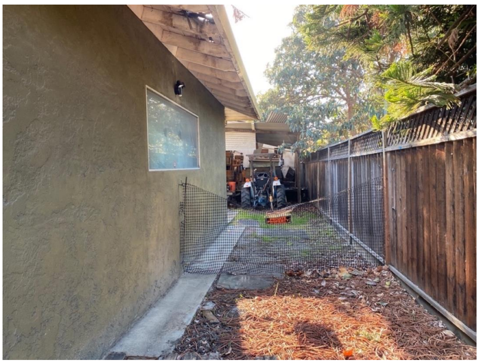
Figure 8. Northwest elevation of 905 N. Capitol Avenue.