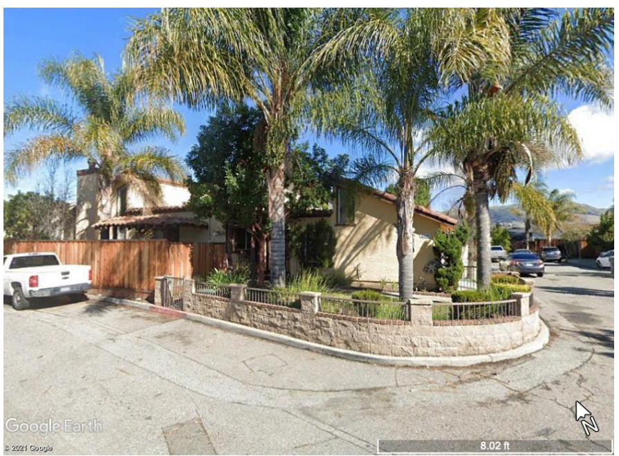
Figure 31. 1030 N. Capitol Avenue. Google Earth, Image Date 2021.