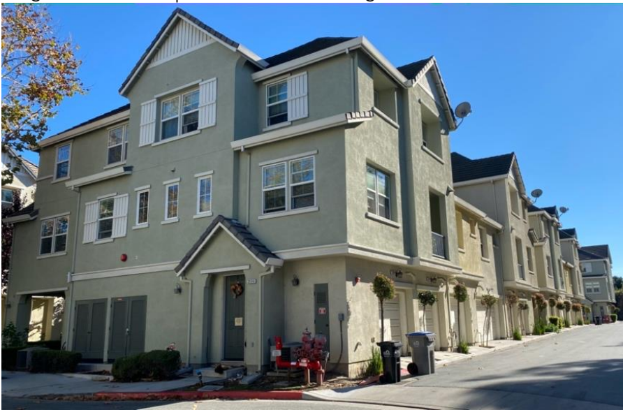
Figure 21. West Corner of Heron Court and Heron Court.

Constructed in 2006 by Taylor Woodrow, the townhouses are three stories with a first floor garage, and are roughly rectangular in plan.<sup>33</sup> The townhouses are Millennium Mansion-inspired in their complex rooflines and the avoidance of a flat exterior wall.<sup>34</sup> They feature a hipped roof with lower steep pitched cross-gabled roofs, and either hip-on-hip or a shed roof addition on the second floor. The facade has a smooth stucco finish, clapboard gable ends, and is punctuated by simple surface and recessed four-pane windows, some with false shutters. The corridors entryways vary between round and segmented arches. Main entrances feature a shallow portico capped with a gabled roof. The parcel totals 17 buildings and 105 units.