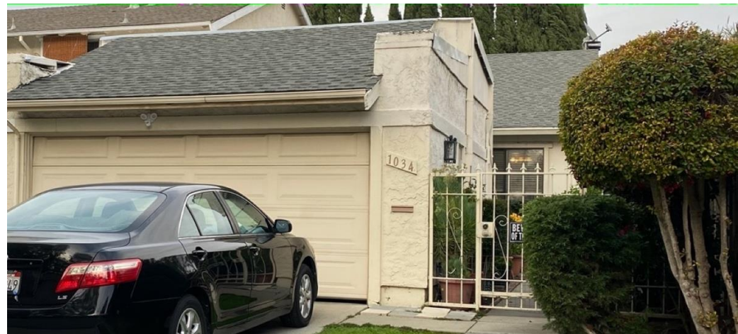
Figure 32. 1034 N. Capitol Avenue.