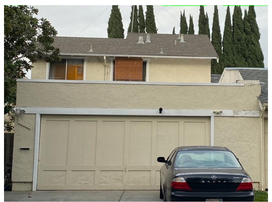
Figure 33. 1036 N. Capitol Avenue.

Constructed in 1977, this vernacular house is roughly rectangular in plan.<sup>42</sup> The wood-frame building has stucco cladding, and a moderately-pitched gable roof. The primary window type is aluminum-sash sliding windows. Notable features include wood wall panel between the first and second floor windows. The detached garage features a flat roof and sits to the north of the house.