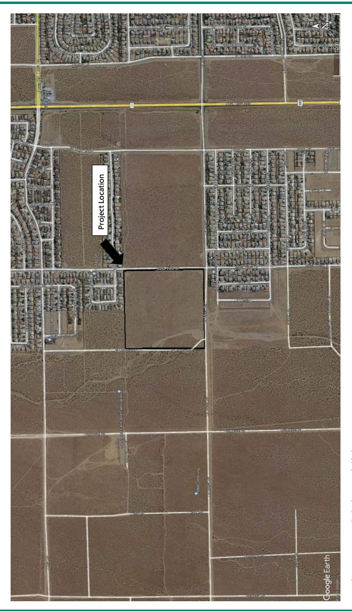
Figure 2: Vicinity Exhibit