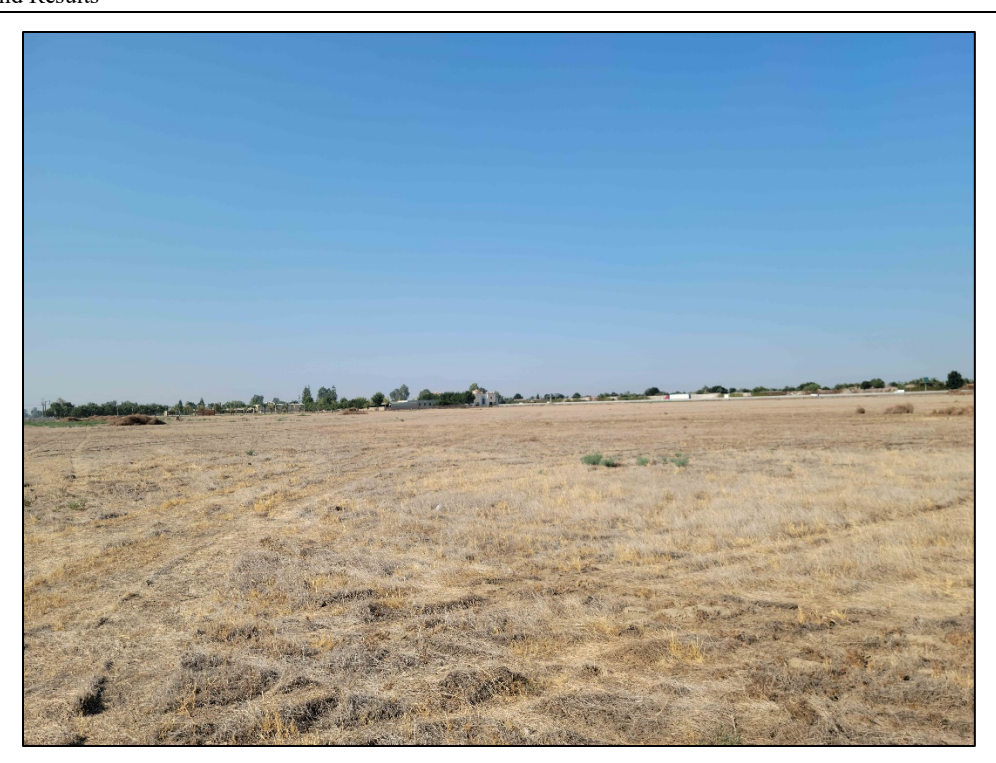
Figure 2. Overview of proposed The Crossings Project study area, looking southwest.