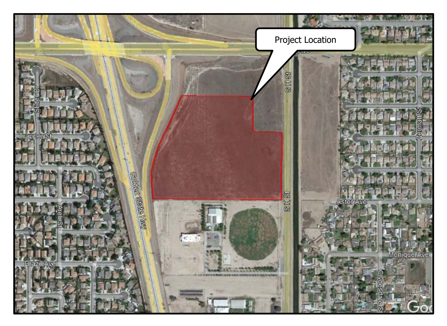
Figure 2-3 depicts the Project site's topography based on United States Geological Survey's (USGS) National Map (USGS 2021). The Project site is located at an elevation of approximately 350 feet above mean sea level and is surrounded by mostly residential land uses.