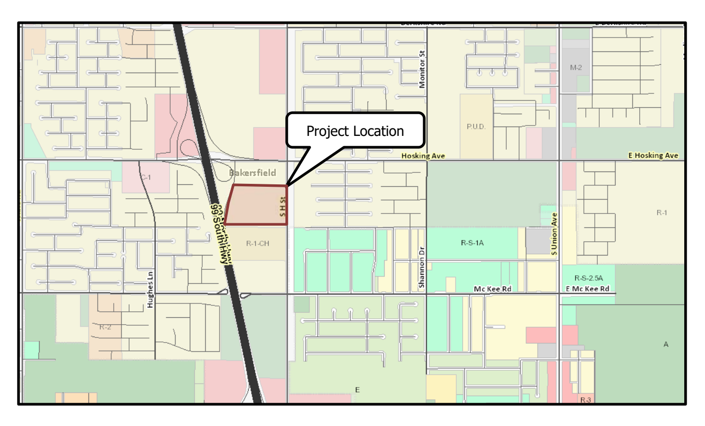
Figure 6-1. City of Bakersfield Zoning

Item 2 under Section 3 – Model Maintenance Procedure, of the Kern COG Regional Transportation Modeling Policy and Procedure Manual states " Land Use Data – General Plan land capacity data or "Build -out capacity" is used to distribute the forecasted County totals, and may be updated as new information becomes available, and is revised in regular consultation with local planning departments. "