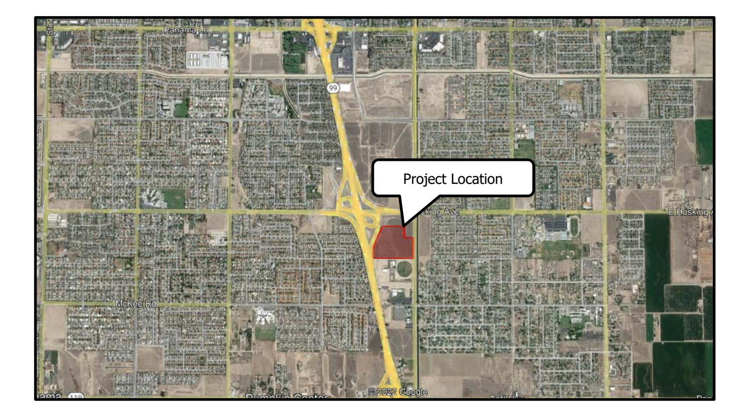
Figure 2-1. Regional Location

There is no specific development or phasing start date, however a June 1, 2022 start date was estimated for this analysis; therefore, most of the defaults in the CralEEMod emissions model were applied to estimate a construction schedule. Figure 2-1 depicts the regional location and Figure 2-2 depicts an aerial view of the Project location.