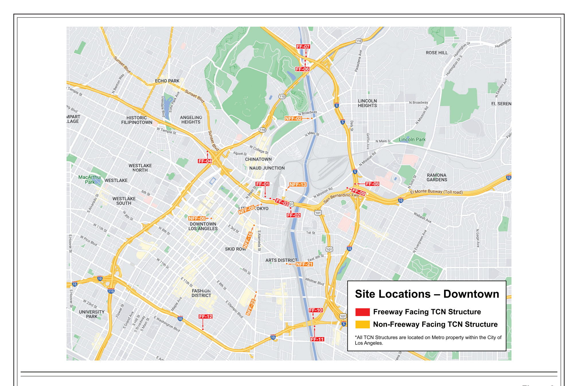
Figure 3 Regional Project Location Map – Downtown