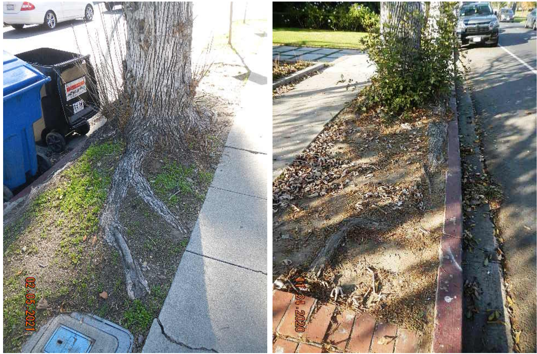
#1 Ash – note surface roots on the north side and damaged sidewalk. #1 Ash – note surface roots on south side