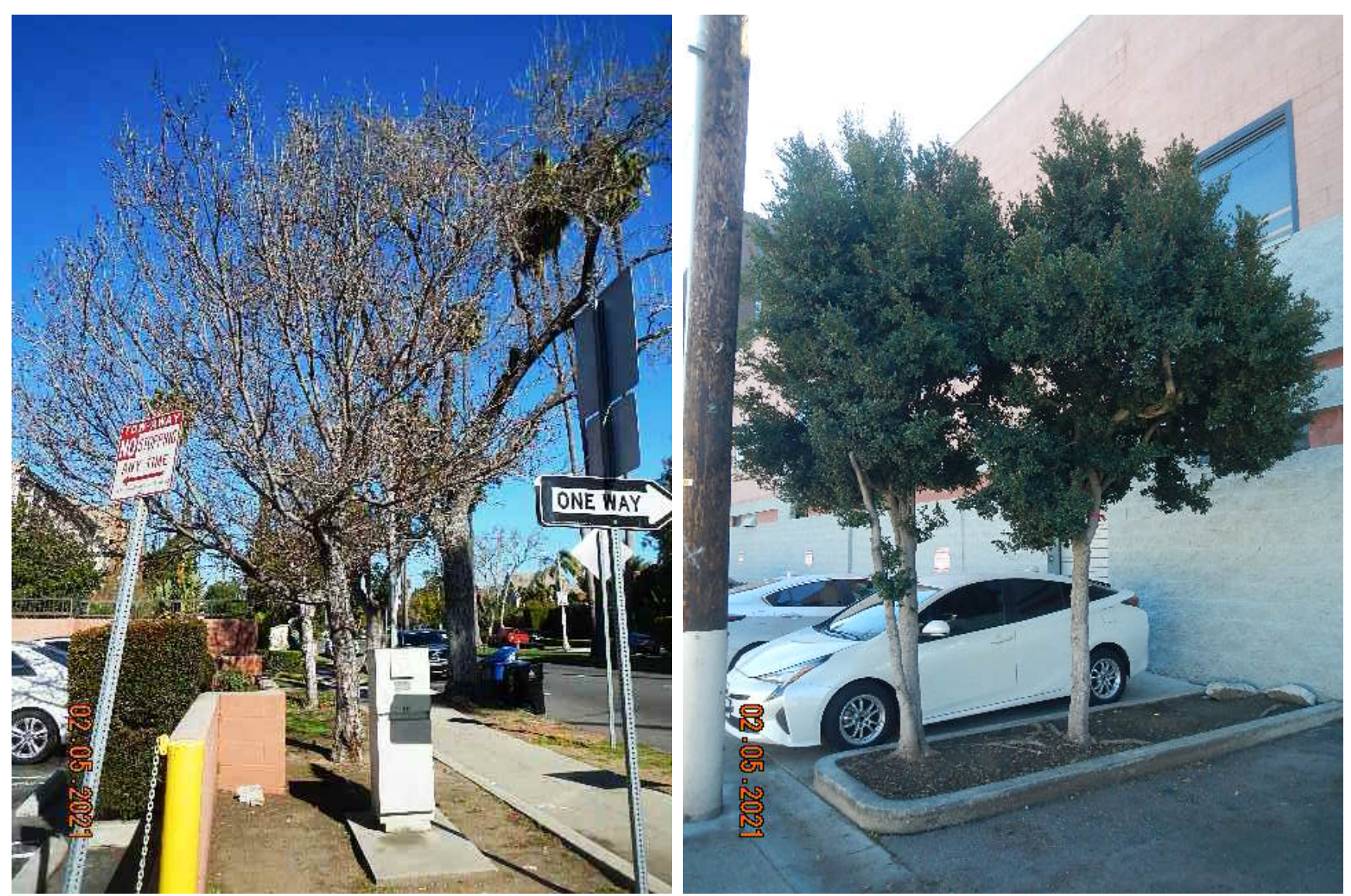
#3 Silver maple – note narrow planter and crowded limbs.