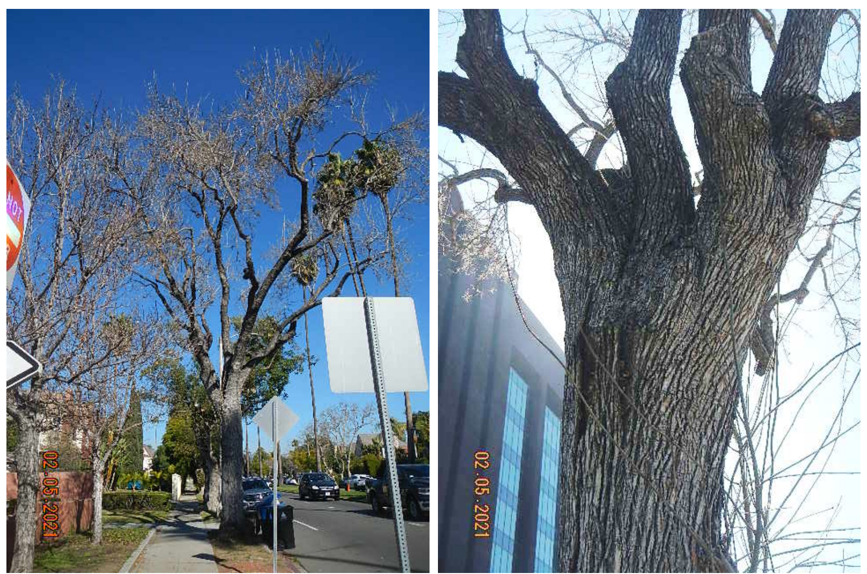
#1 Arizona ash on Highland has been lion-tailed and headed.

#1 Ash, note included bark and loose bark below - a warning sign