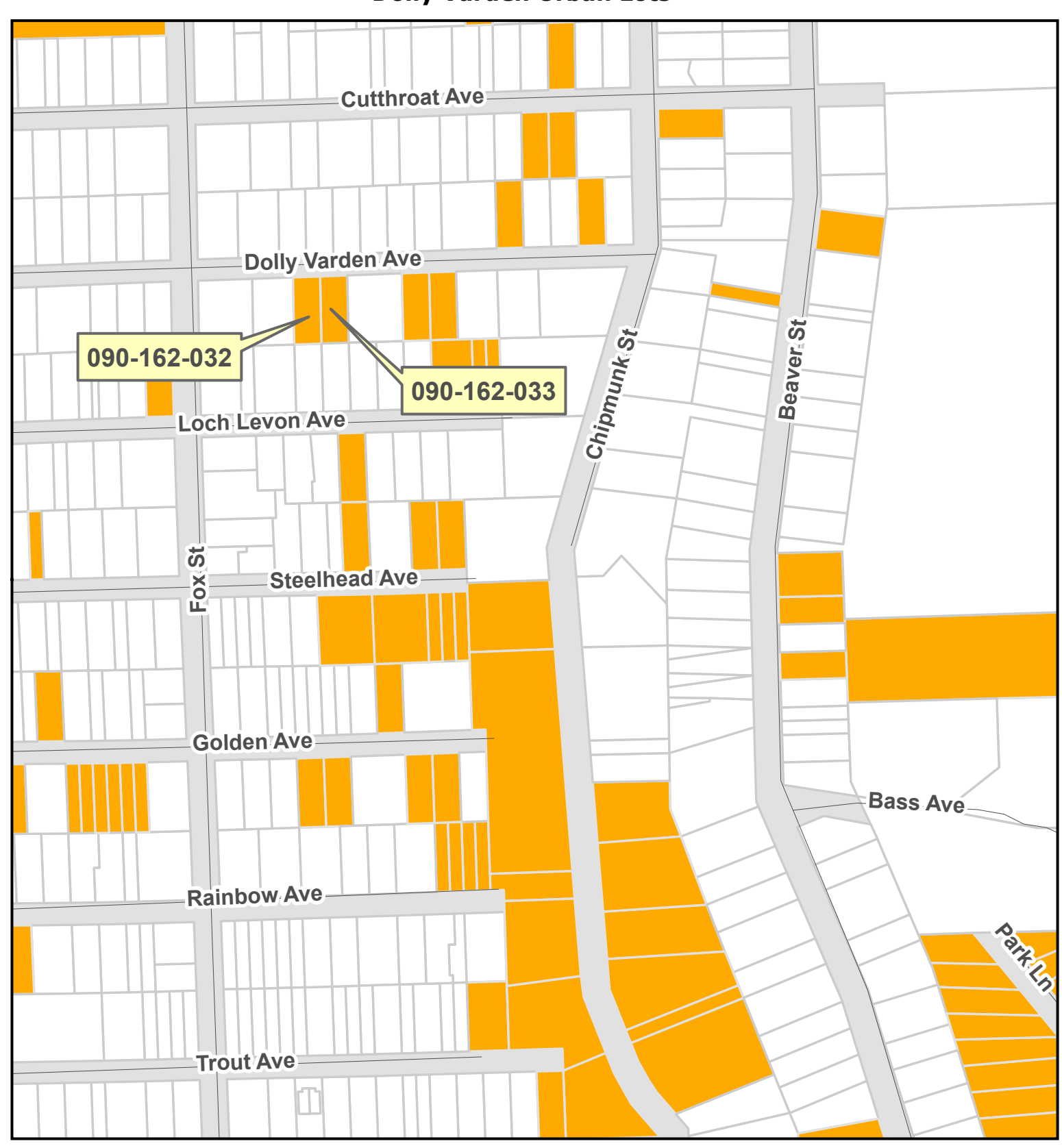
EXHIBIT A Dolly Varden Urban Lots