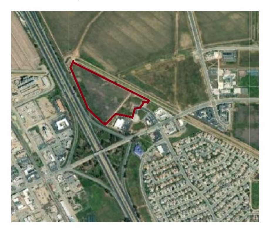
Exhibit B-Site Photo