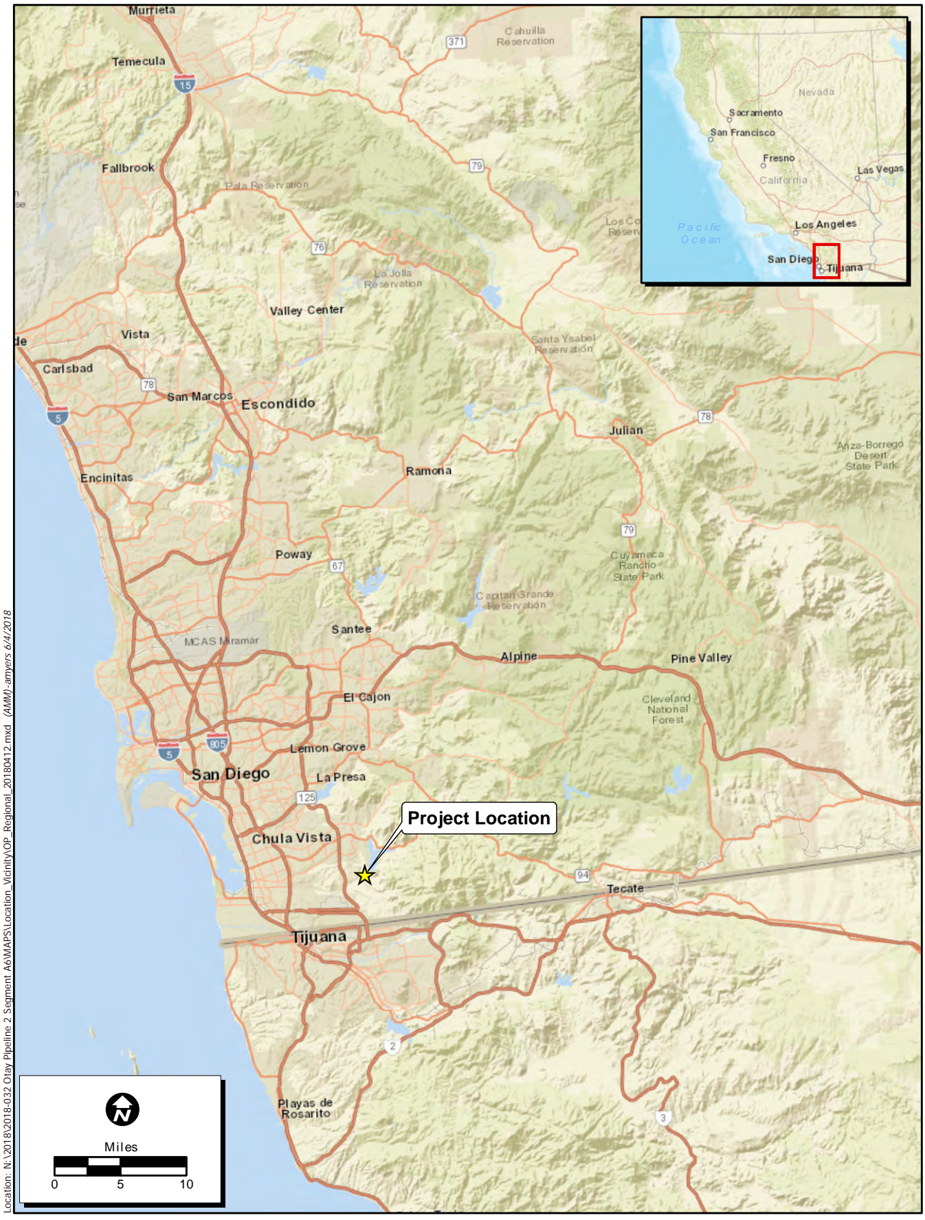
Map Date: 4/13/2018

Figure prepared by ECORP Consulting Inc. Service Layer Credits: Sources: Esri, HERE, Garmin, USGS, Intermap, INCREMENT P, NRCan, Esri Japan, METI, Esri China (Hong Kong), Esri Koree, Esri (Thailand), NGCC, © OpenStreeMay contributors, and the GIS User Community Figure prepared by ECORP Consulting Inc.