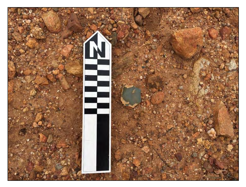
Figure 6. Isolated find OTP-001-I: gray CCS secondary flake. May 15, 2018. Photo # 2