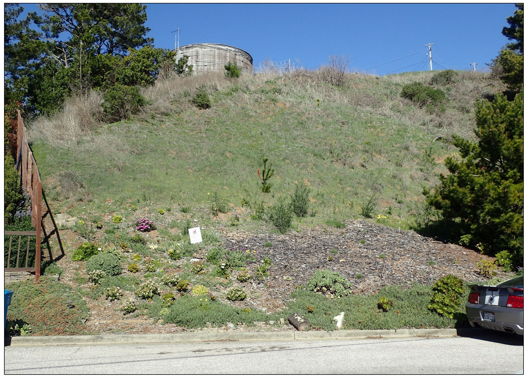
Photograph 3. Photograph showing several biological communities and steep slopes of the Study Area, facing north. Taken February 18, 2021.