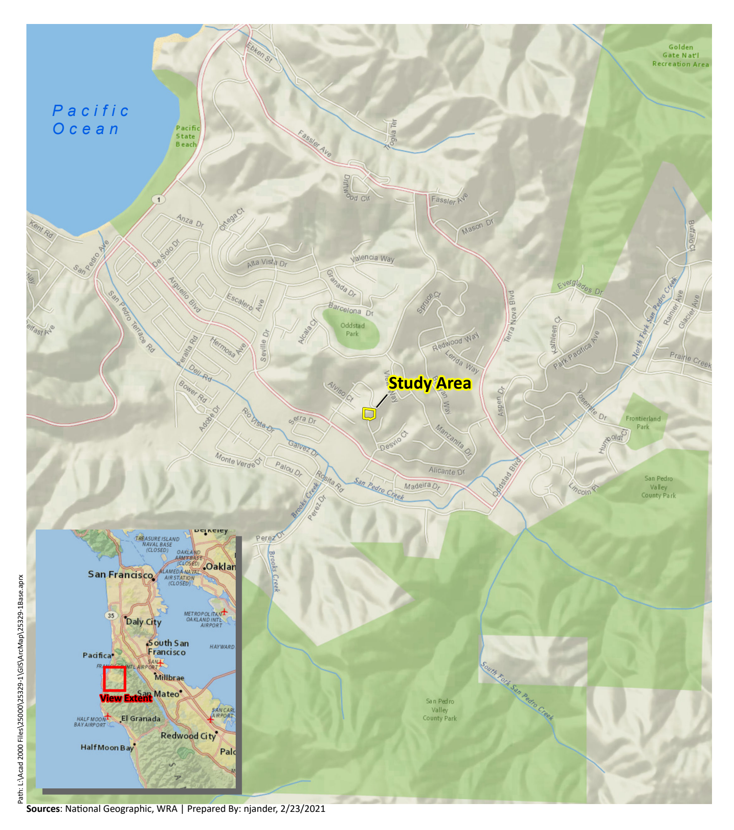
Figure 1. Study Area Regional Location Map

Biological Resource Assessment Sheila Tank Replacement Pacifica, San Mateo County, California