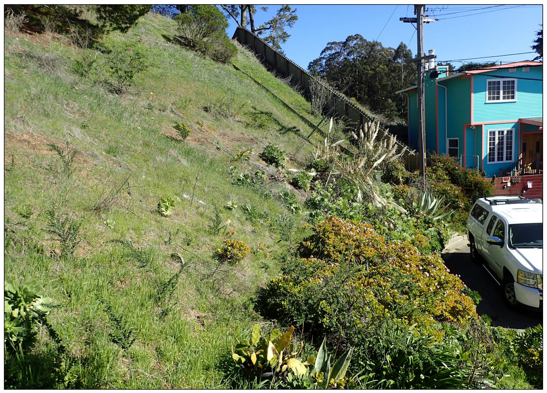
Photograph 4. Photograph showing ruderal herbaceous biological community in the Study Area, facing east. Taken February 18, 2021.