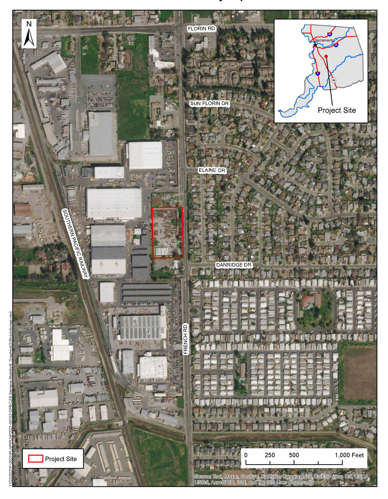
Plate IS-1: Vicinity Map