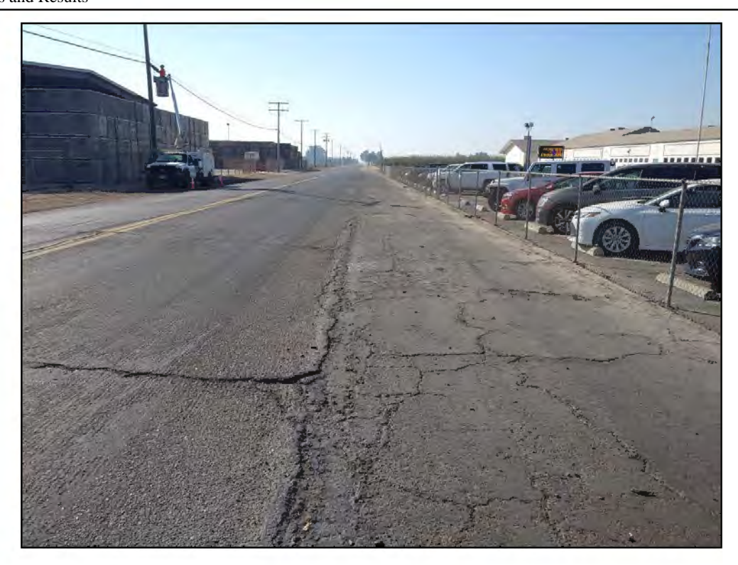
Figure 2. Overview of the proposed pipeline corridor along Woodville Road, looking south. Note - Woodville View Elementary School on right.