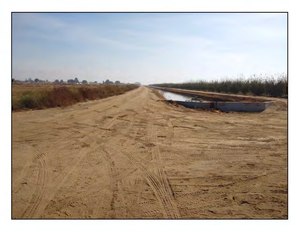
Figure 4. Overview of proposed pipe corridor along dirt road right-of-way between Road 164 and Woodville Road, looking east.