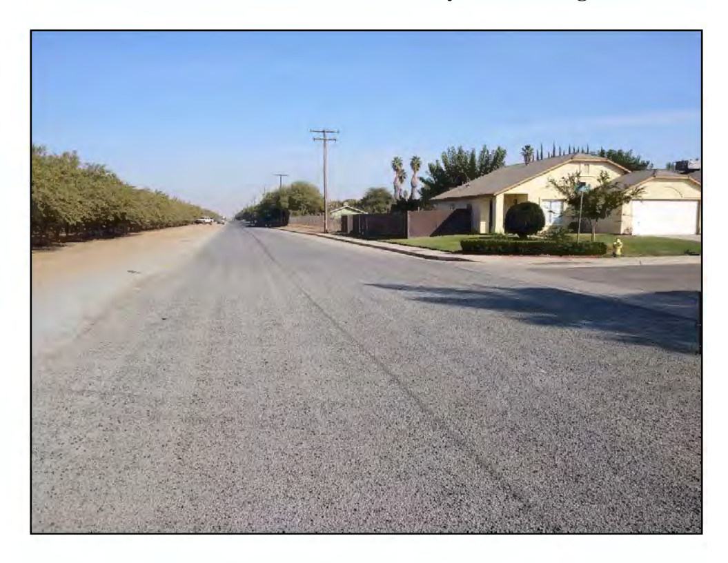
Figure 3. Overview of the proposed pipeline corridor along Road 164, looking north.