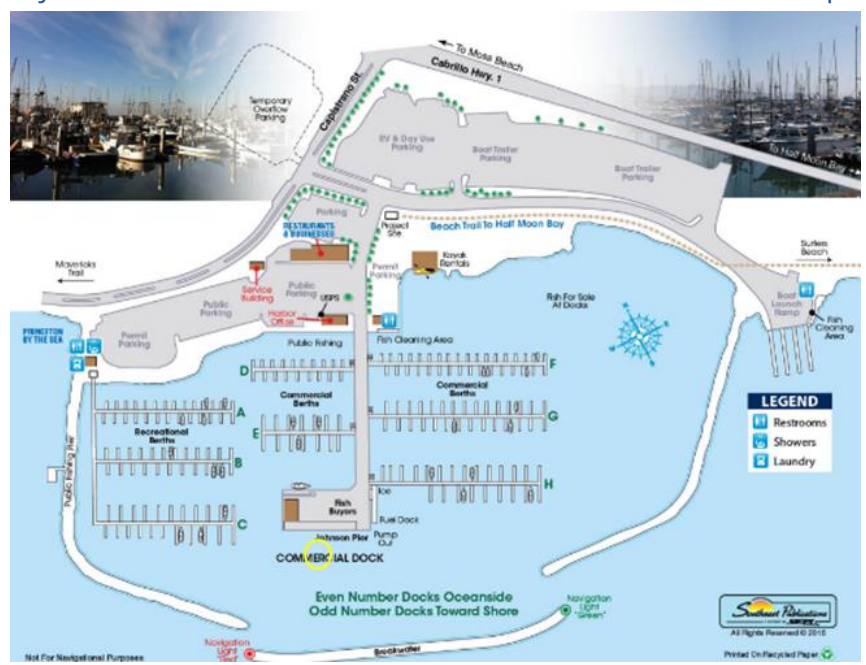
Attachment 1: Pillar Point Harbor net pen location. Yellow circle indicates approximate net pen site. Release after acclimation will be in outer harbor.