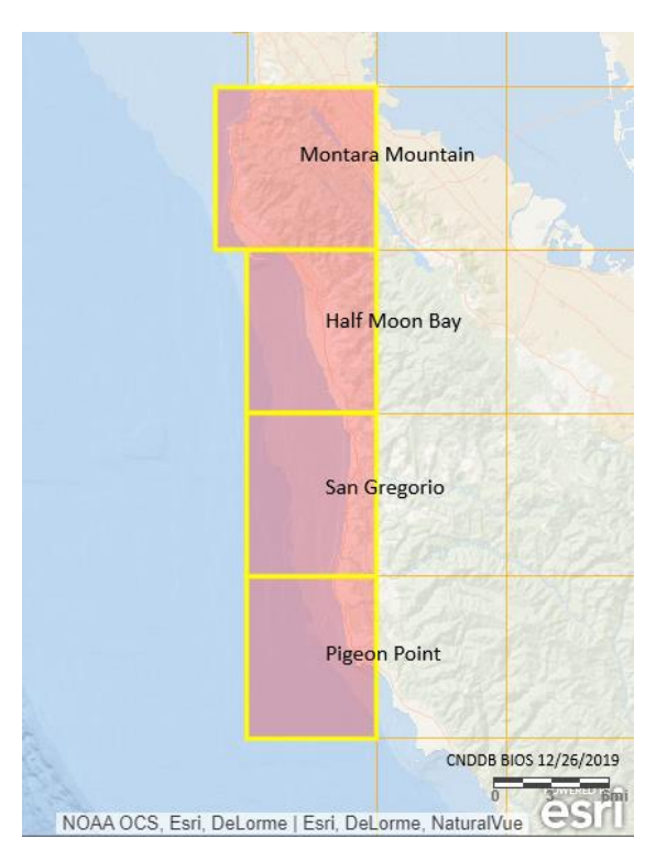
Attachment 2: CNDDB Grids included in species review.