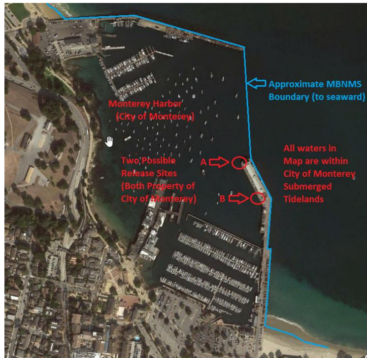
Attachment 1: Monterey Harbor release locations. Red circles indicate approximate potential release sites. All releases will be interior to Municipal Wharf #2.