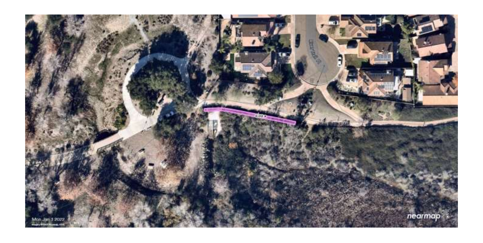
Exhibit B Section D – Mission Creek Trail Fence