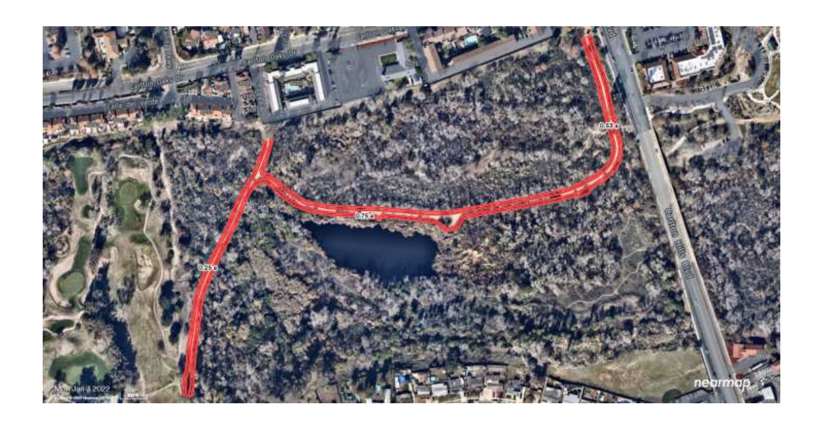
Exhibit B Section A - Mast Park West