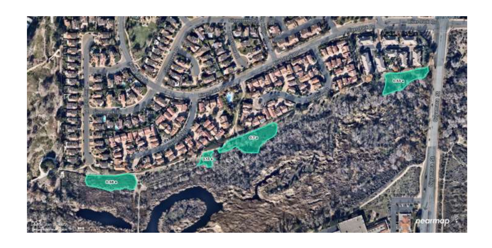
Exhibit B Section C – Mission Creek Trail Acacia