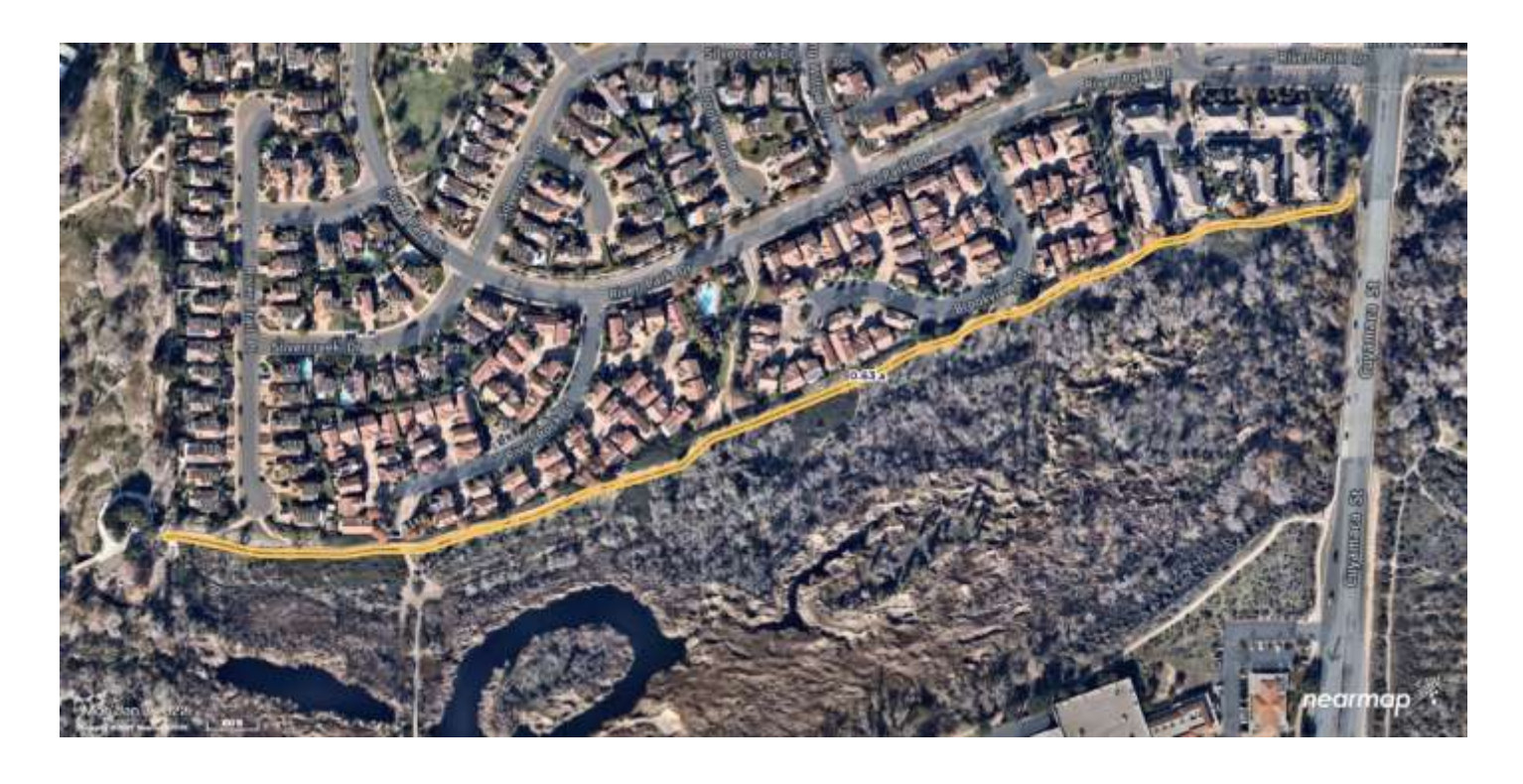
Exhibit B Section B – Mission Creek Trail