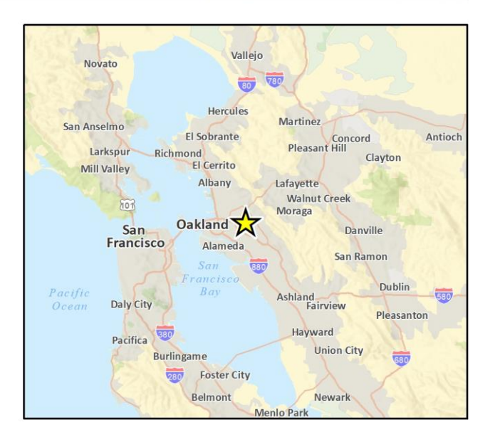
Fig X NOP Location Ma