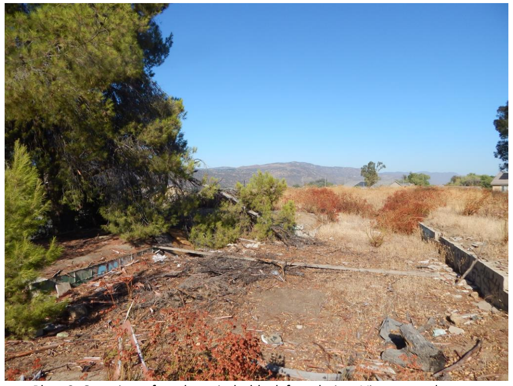
Plate 3. Overview of modern cinderblock foundation. View towards west.