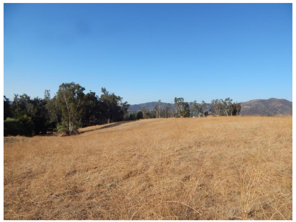
Plate 1. Overview of the project area looking from northeast to southwest. View towards southwest.

Although the pipe, concrete remnants, and the cinderblock foundation were observed during the survey, none could be determined to be 45 years or older in age, and thus are not considered to be historic cultural resources. No archaeological material was observed during the survey.