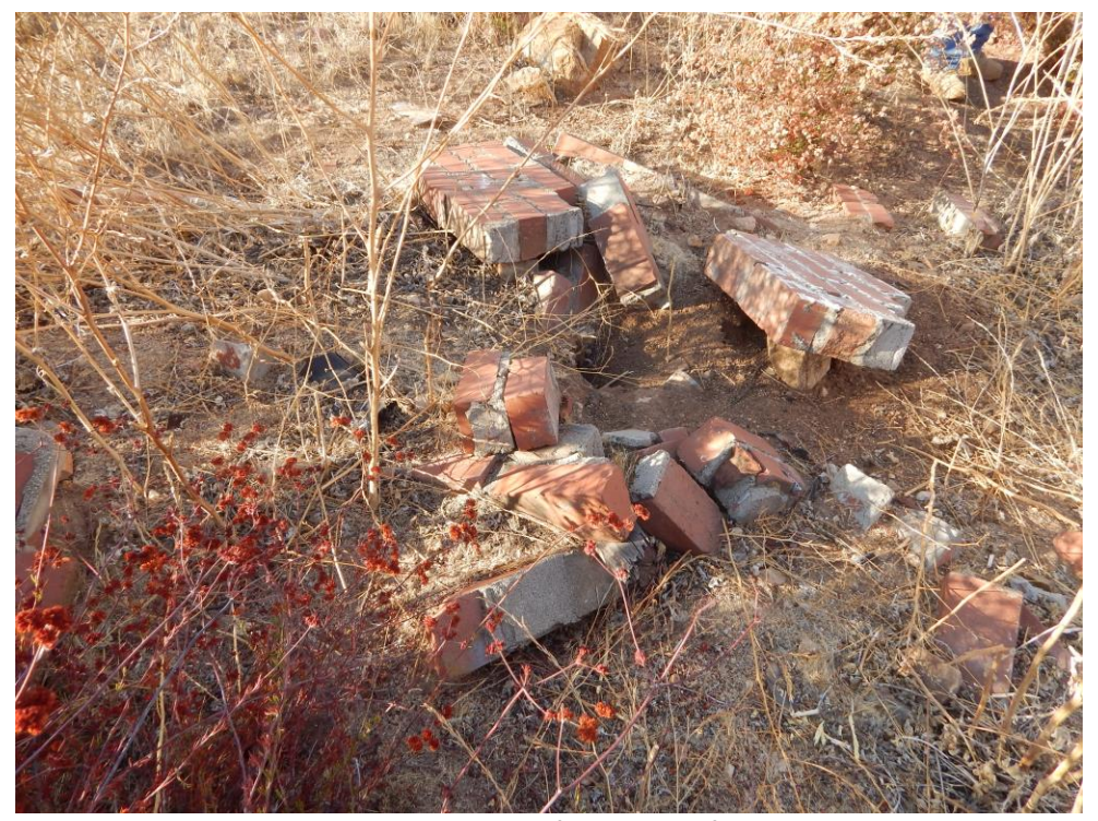
Plate 2. Close up view of modern refuse dump.