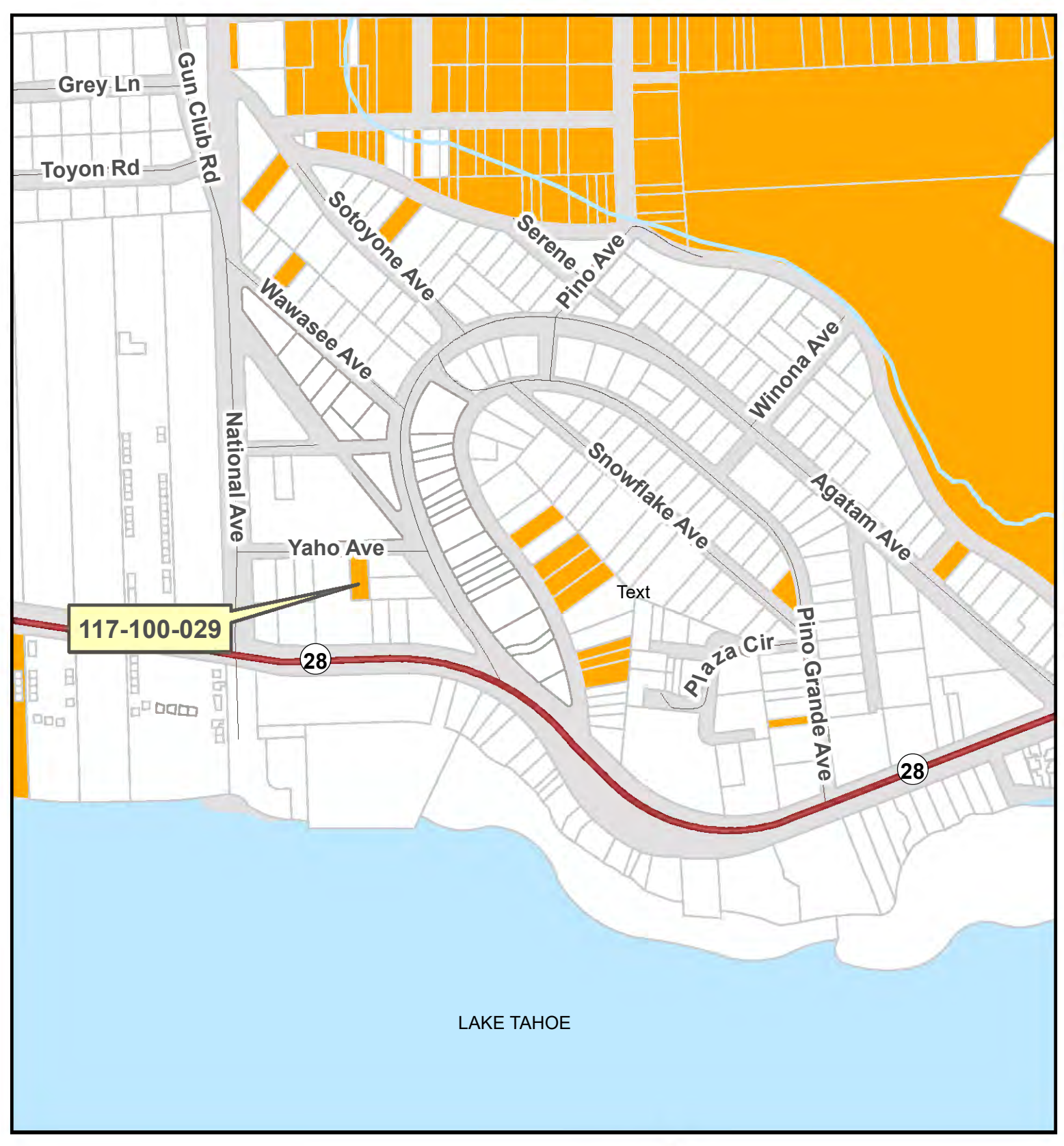
EXHIBIT A Yaho Restoration Project