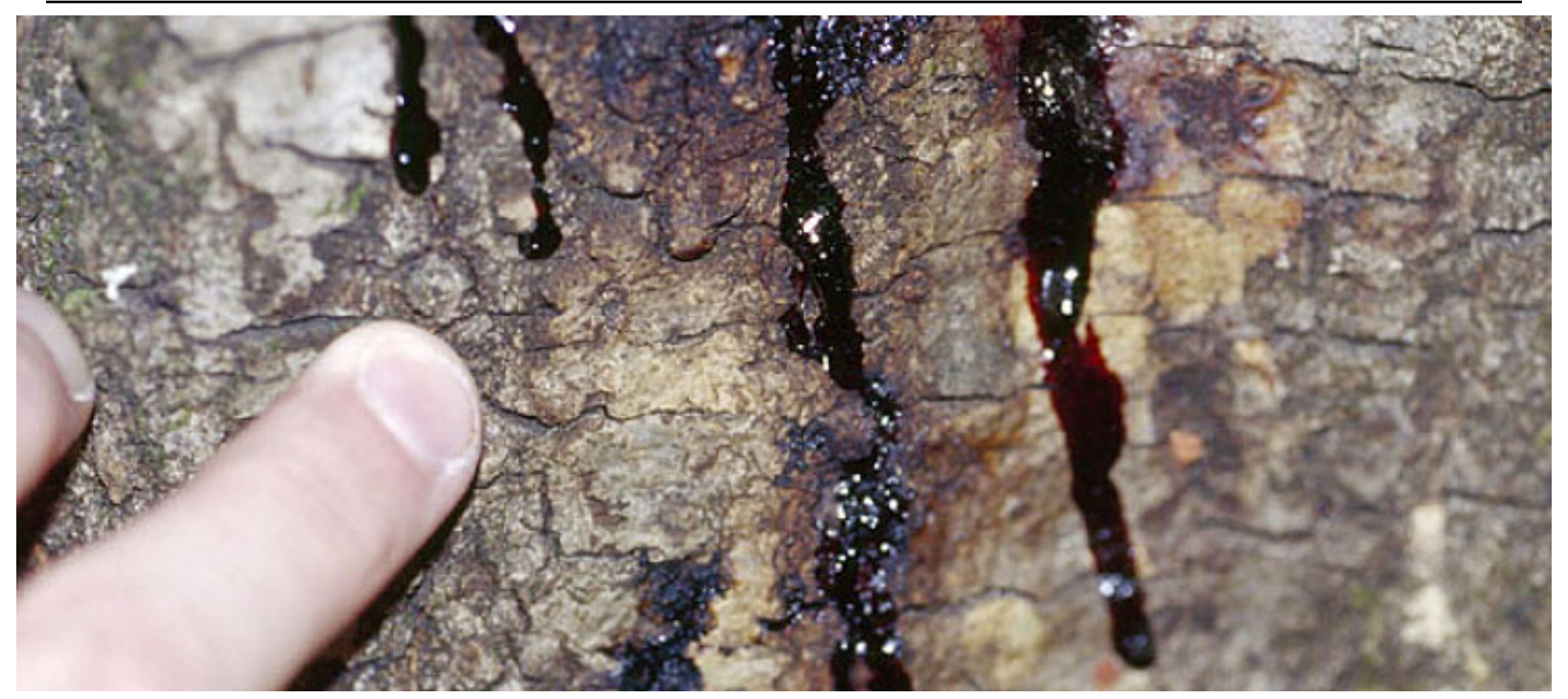
symptom of sudden oak death caused by Phytophthora ramorum on coast live oak (Quercus agrifolia)