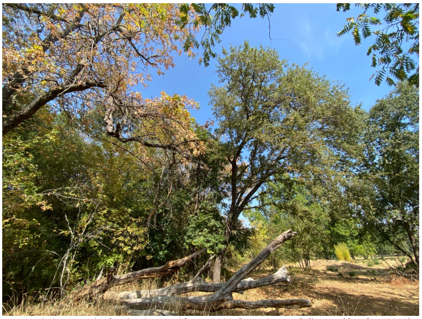
existing trees in the riparian corridor at 2008 Grant Street, Calistoga (October, 2020)

Eleven indigenous oak ( Quercus spp. ) trees are proposed for removal within a riparian corridor on site. Species include coast live oak ( Quercus agrifolia) and valley oak ( Quercus lobata ). To mitigate their removal planting one hundred and twelve replacement trees is proposed. New tree materials should be sourced from local watersheds, planted and maintained with protection from deer, weeds, and drought. I recommend monthly & annual monitoring.