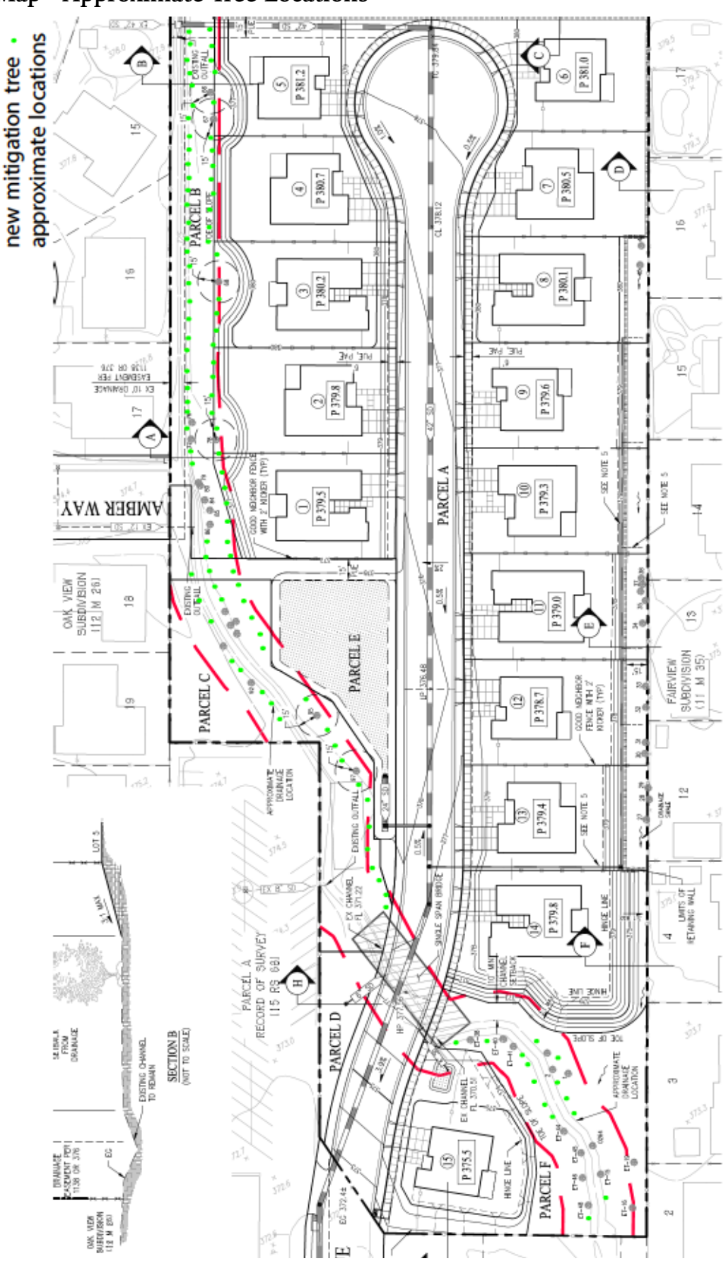
Tree Location Map - Approximate Tree Locations