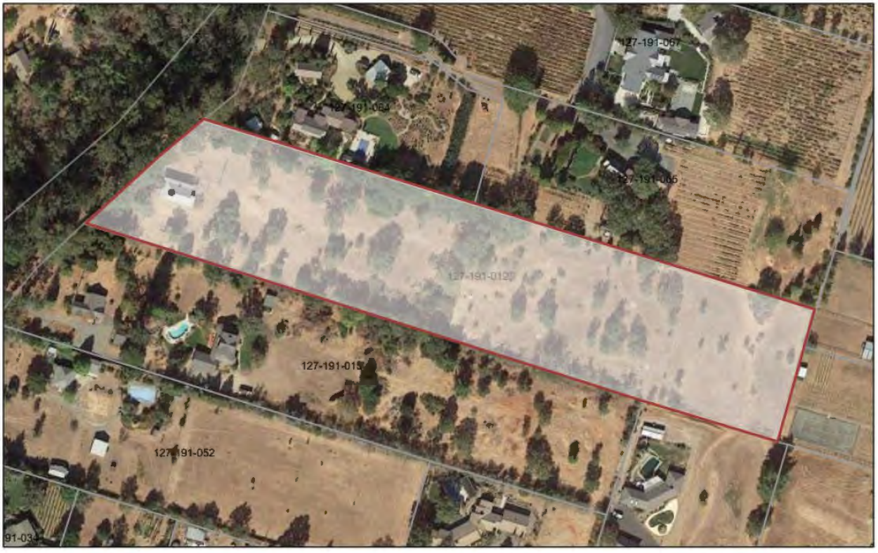
Figure 2. Aerial map