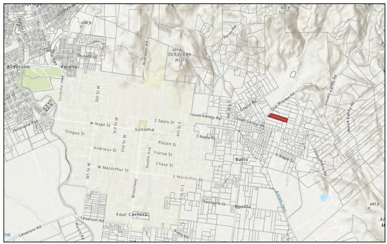
Figure 1. Project location