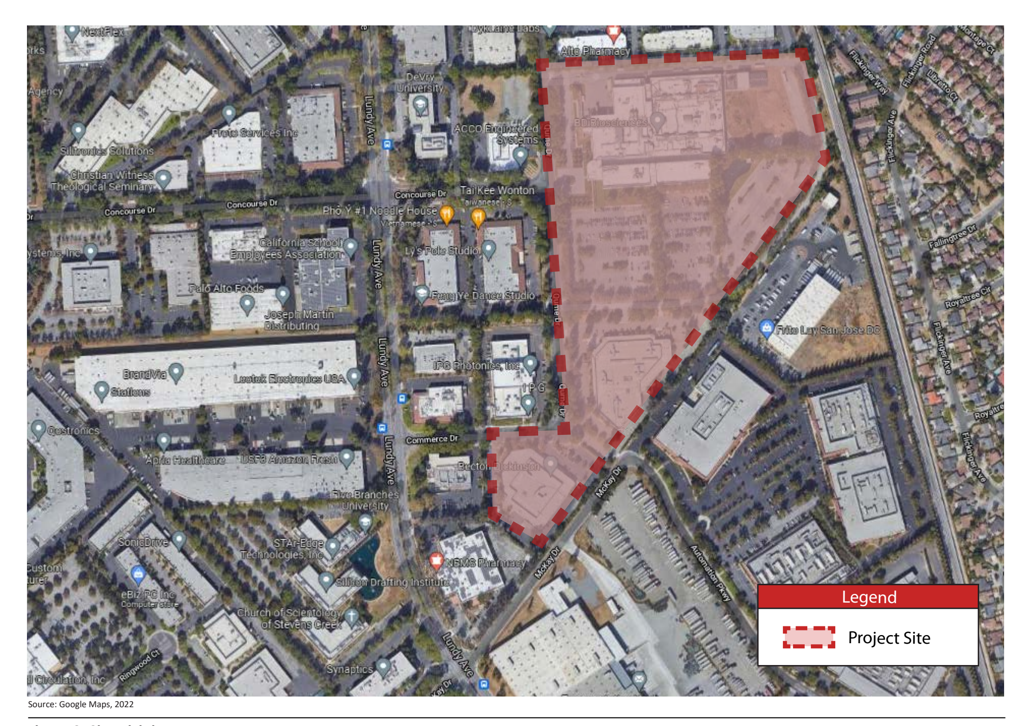
Figure 2: Site Vicinity