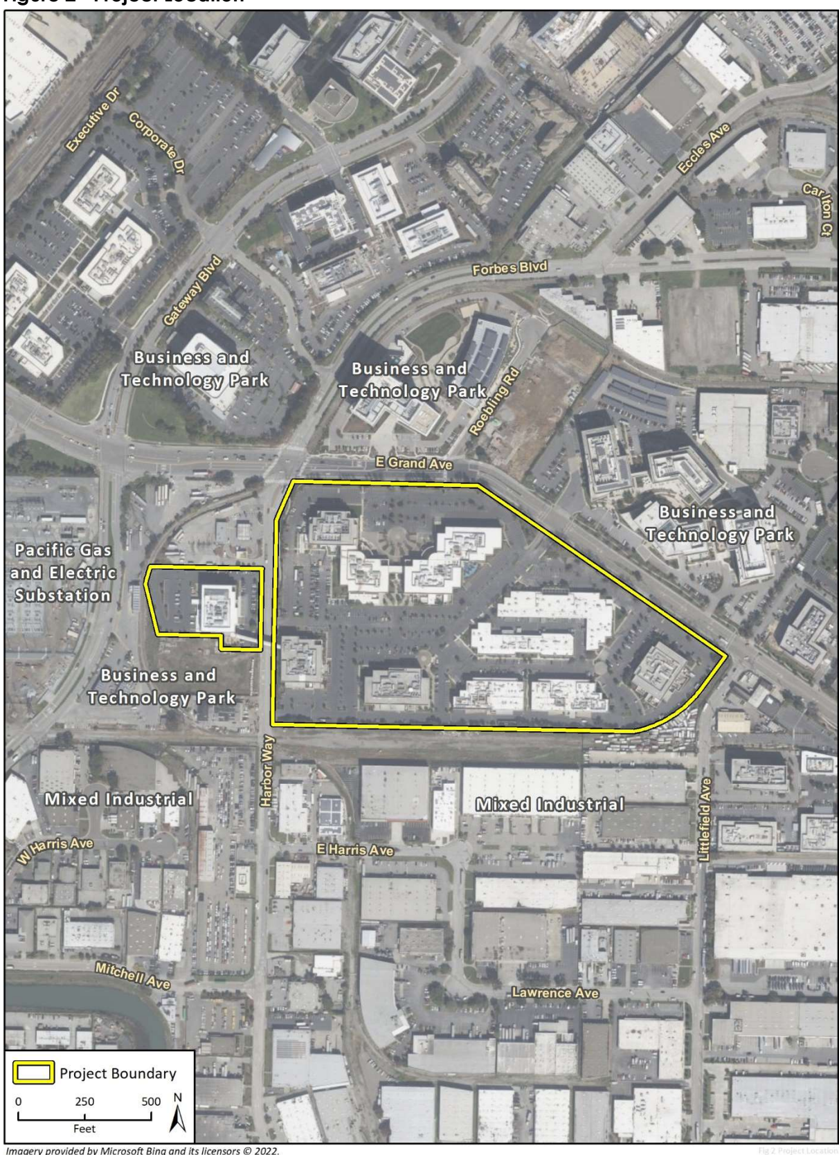
Figure 2 Project Location