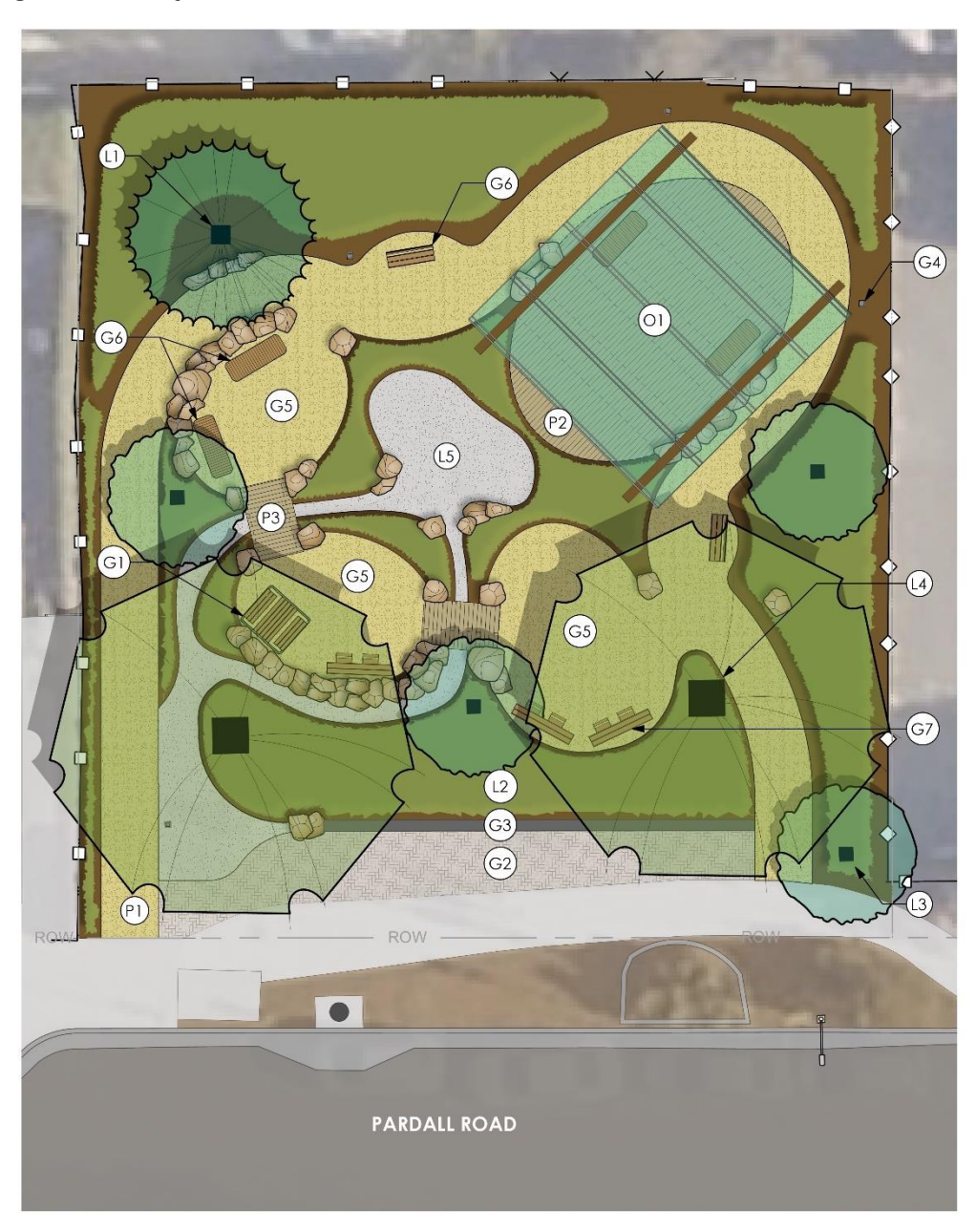
Figure 4 Project Site Plan