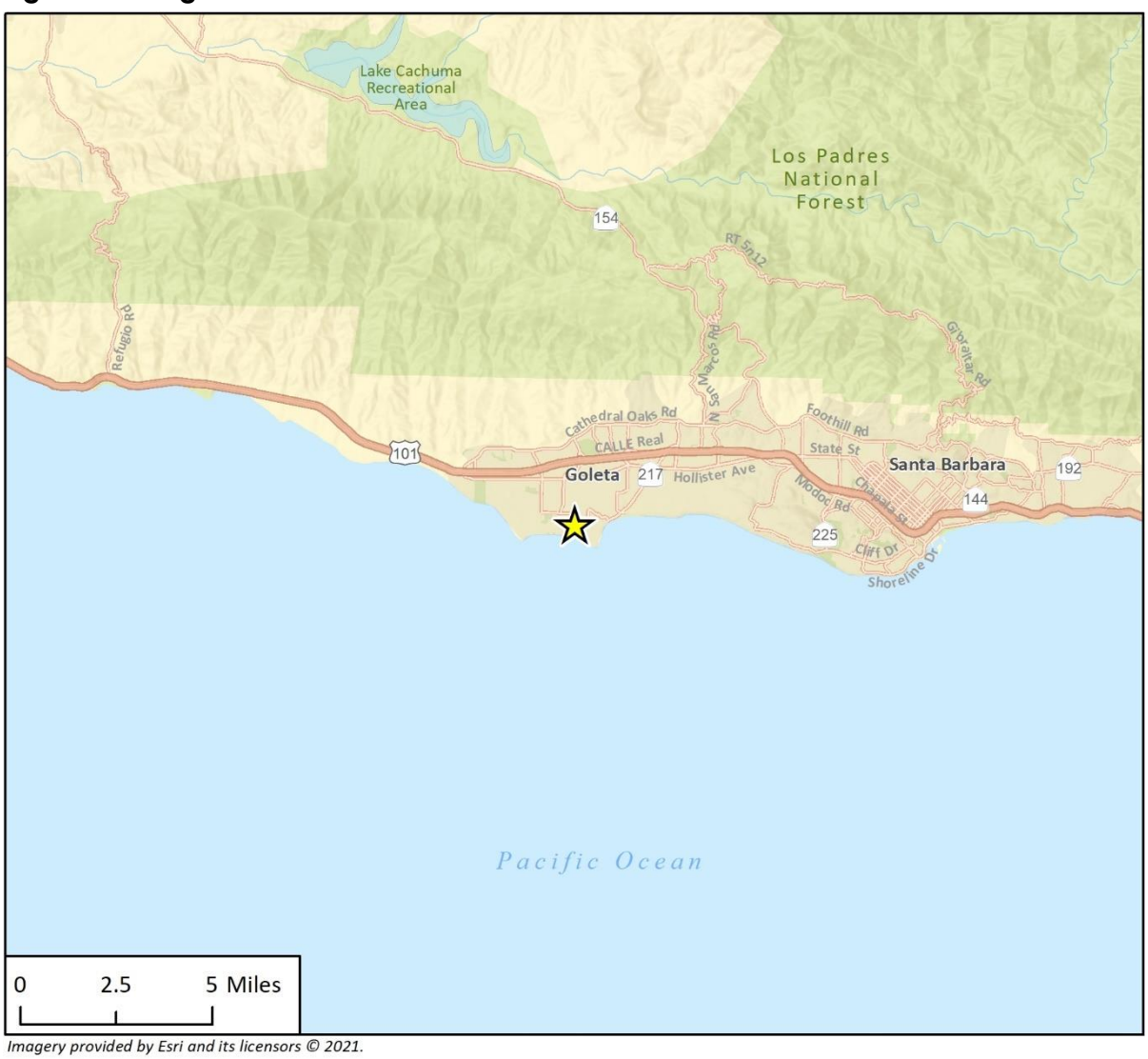
Figure 1 Regional Location