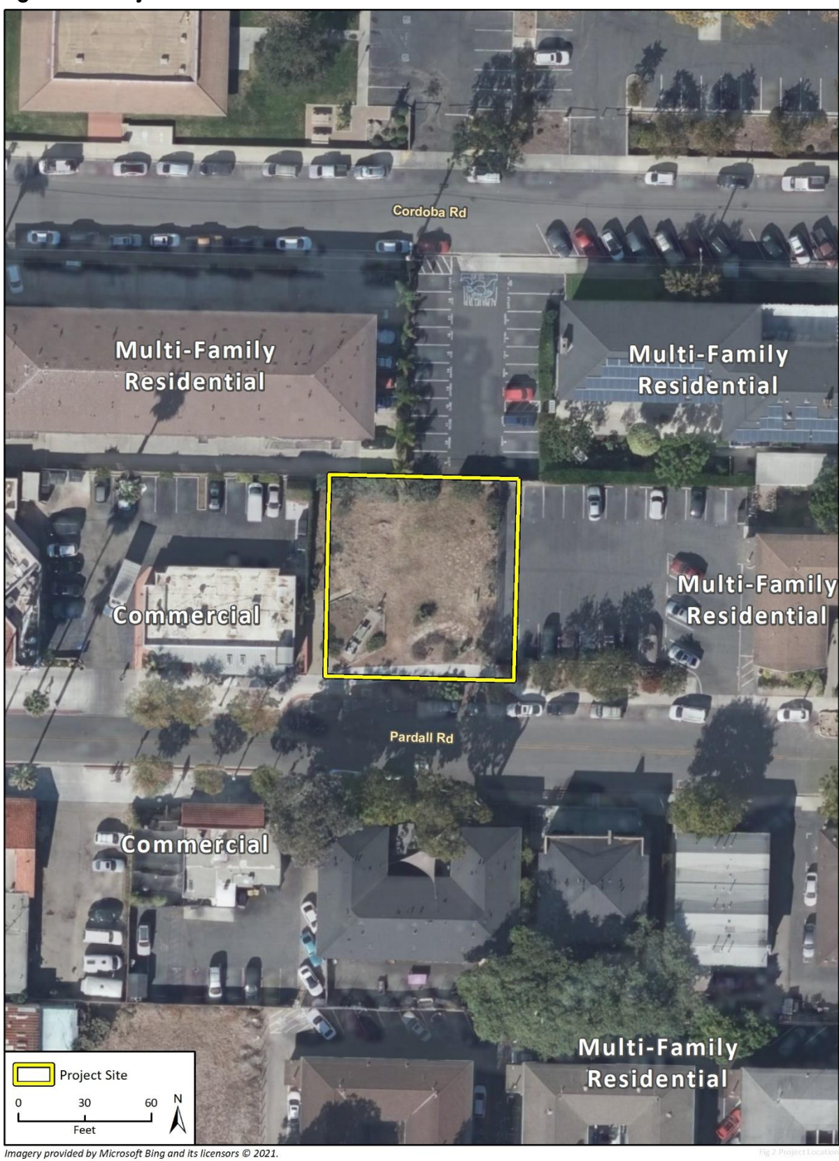
Figure 2 Project Site