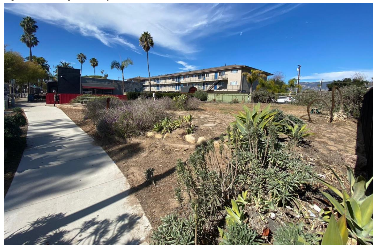
Photograph 1: View of project site looking northwest from sidewalk.