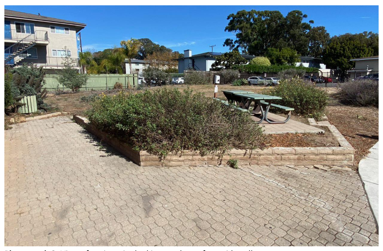
Photograph 2: View of project site looking northeast from sidewalk.