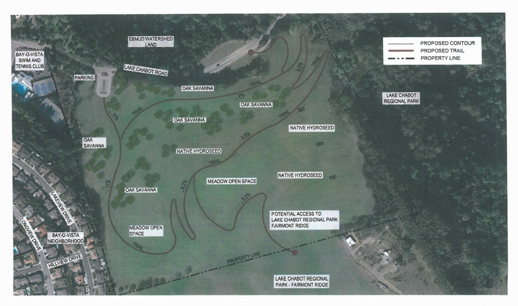
Figure 3: Site Restoration Design Concept