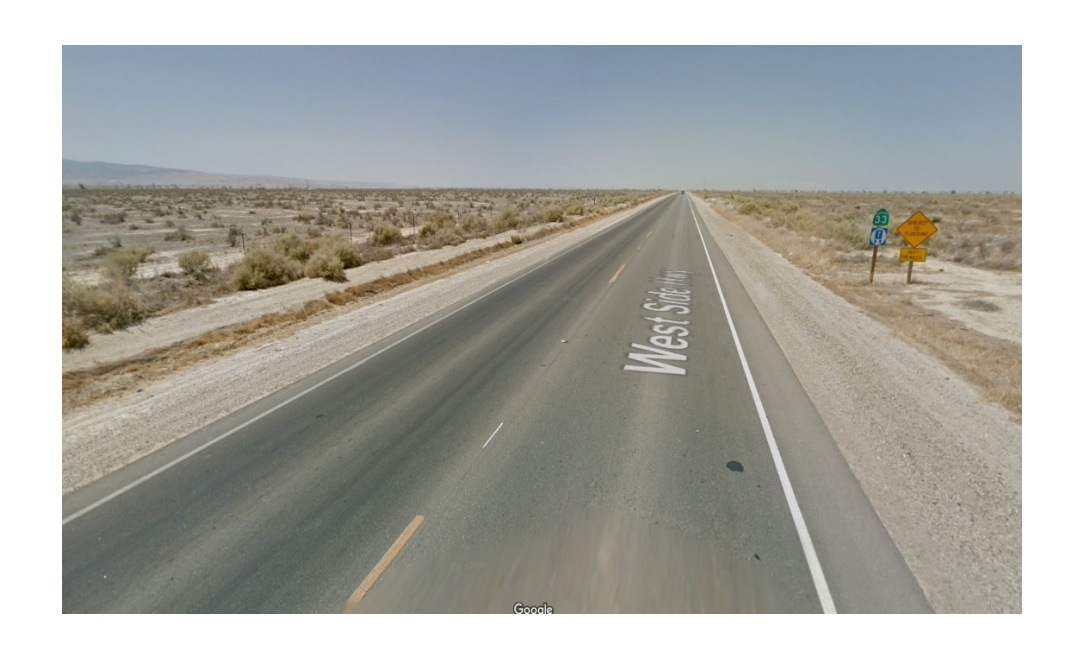
Prepared by the State of California Department of Transportation